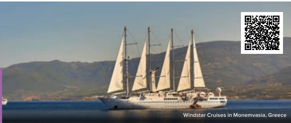
Windstar Cruises in Monemvasia, Greece

From Athens' iconic Acropolis to island gems and archaeology in Ephesus—history, culture, and seaside charm converge on this fascinating and relaxing cruise.