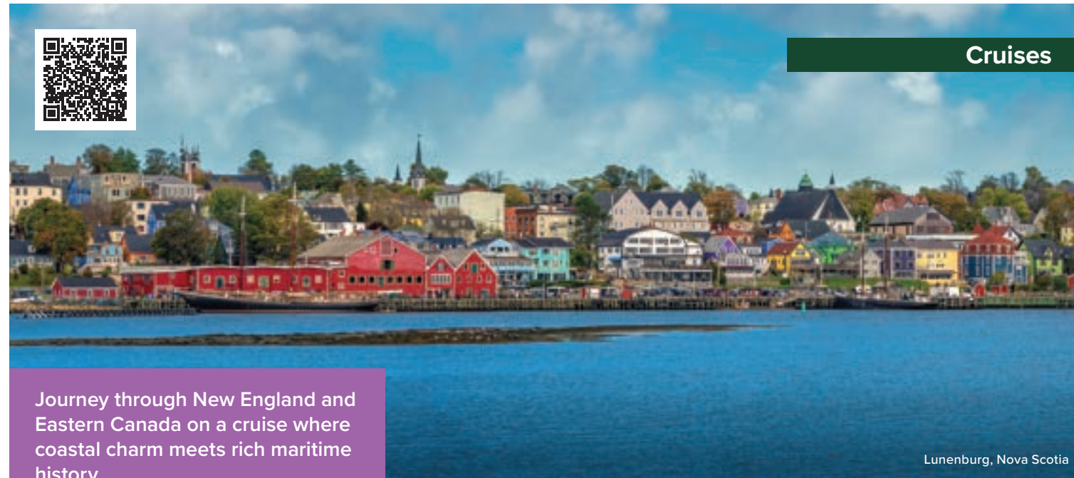
Lunenburg, Nova Scotia