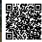
Tournament of Roses Parade®

Join the New Year festivities at Southern California's iconic Rose Parade.