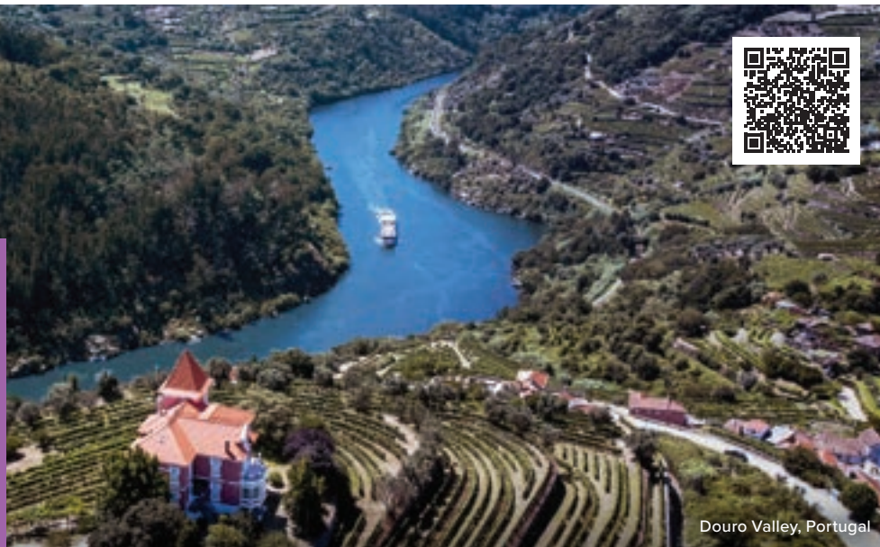
Douro Valley, Portugal

Visit the fairy tale Pena Palace. Explore the Baroque-style Palácio de Mateus. Stroll down the medieval streets of Castelo Rodrigo, set on a hilltop. Sample port wine and local delicacies.