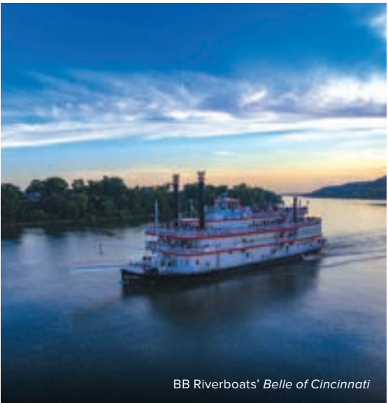
BB Riverboats' Belle of Cincinnati