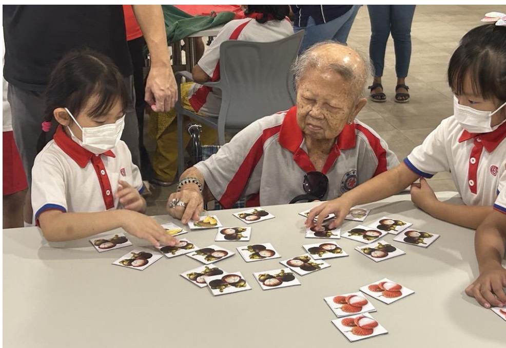
Children from PCF Sparkletots Preschool @ Changi-Simei Blk 131 interacting with a senior from Moral Home for the Aged Sick.