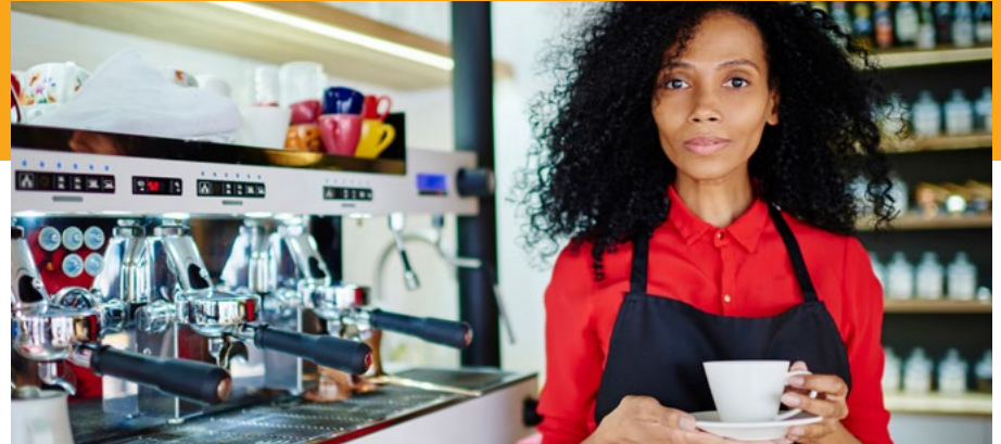
Black-Owned Business Development