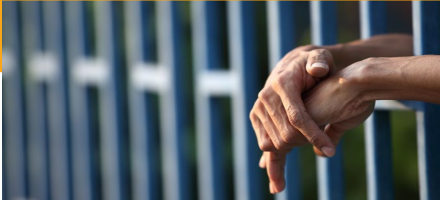
Criminal Justice Reform

$5 million to establish a community investment strategy to address systematic racism faced by Black Americans and advanced social and economic equity.