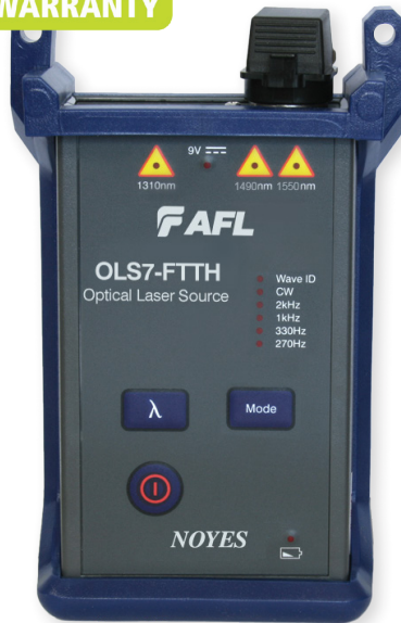
OLS7 Optical Laser Source