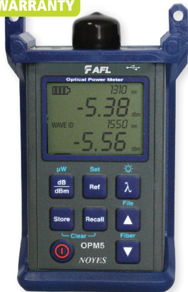
OPM5 Optical Power Meter