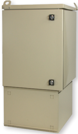
288 Fiber (Closed)