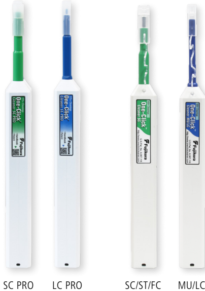
SC PRO LC PRO SC/ST/FC MU/LC

One-Click Cleaner D-LC (Duplex LC) - The One-Click Cleaner D-LC cuts cleaning time in half by effectively cleaning both connectors of a duplex LC connector simultaneously. Available in a long-lasting 500+ clean pen shape.