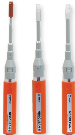
NEOCLEAN-E Models (E1, E2, E3)