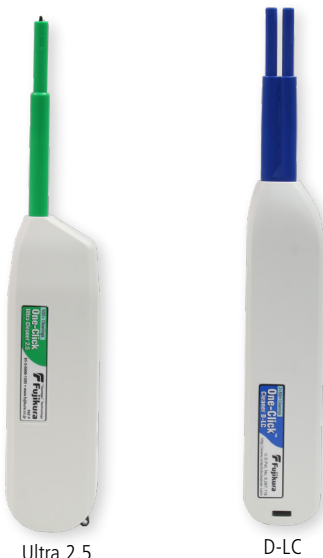
Ultra 2.5 D-LC