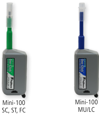
Mini-100 SC, ST, FC Mini-100 MU/LC