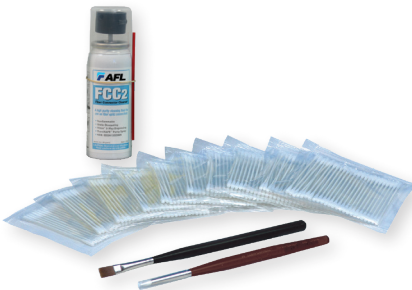
Splicer V-groove Cleaning Refill Kit