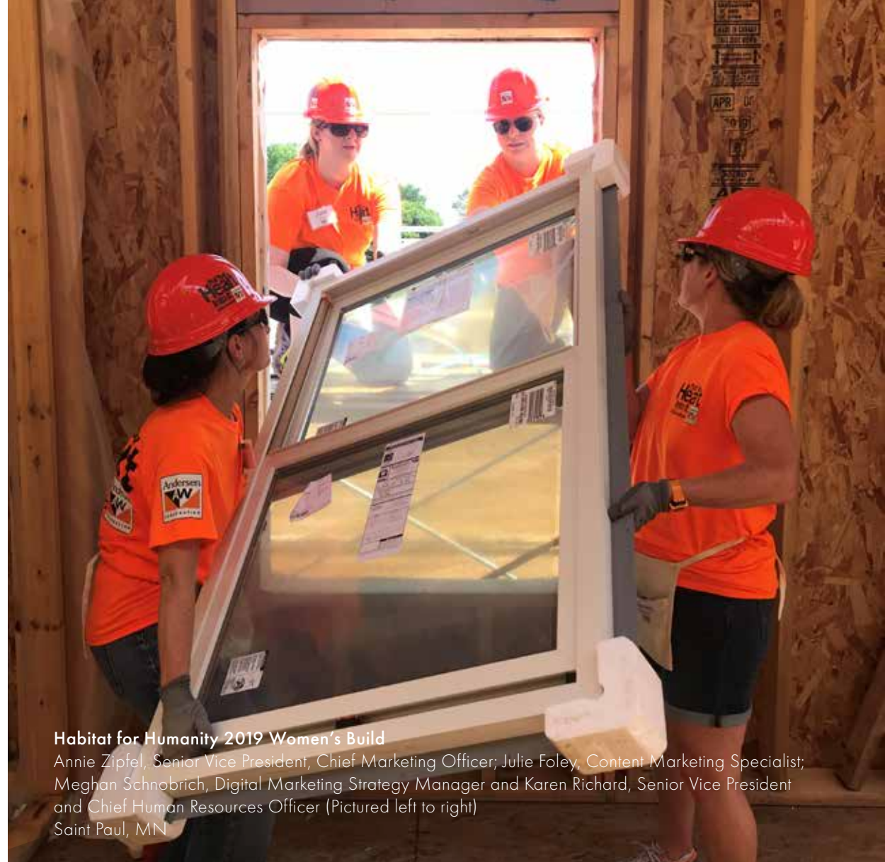
Habitat for Humanity 2019 Women's Build

Our employees are passionate about Habitat's work, as both volunteers and donors. During our 2019 employee giving campaign, Andersen provided a donation match of 50 cents for every dollar donated by employees to Habitat for Humanity.