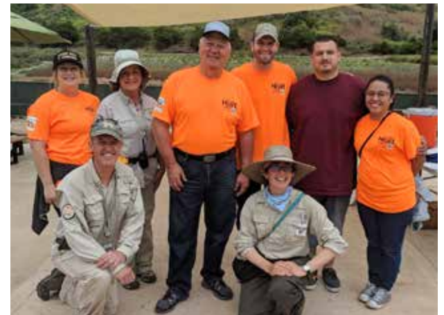
Andersen employee volunteering cleaning up the environment in the communities where they work throughout 2019.