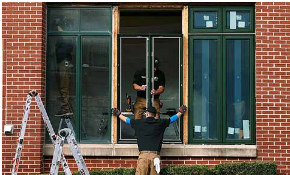
Hope Lodge of Kansas City Over 100 windows replaced Kansas City, Kansas

In addition to cancer research and other programs, American Cancer Society Hope Lodges provide cancer patients and their caregivers a free place to stay while they are undergoing treatments — which may be far away from where they live. Having a place that is a "home away from home" while they are undergoing treatment, instead of having to worry about travel, lodging, or staying in a safe place, lets patients focus on the most important thing — getting well.