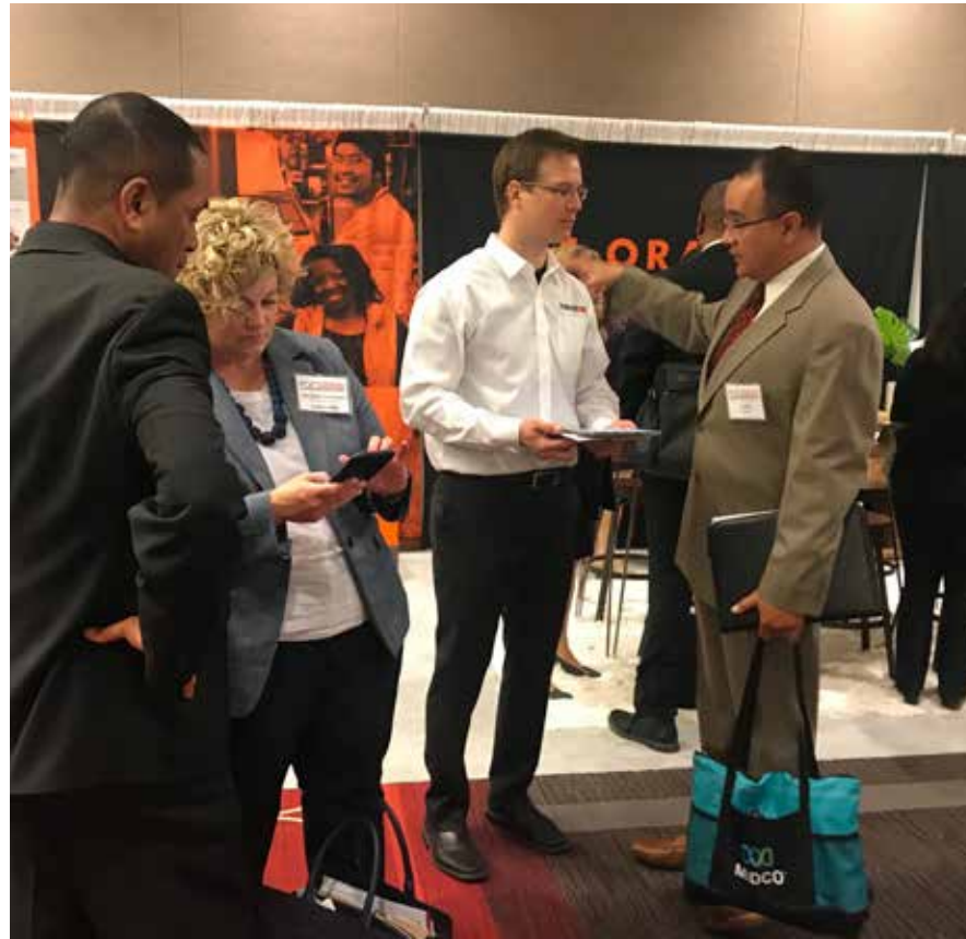
People of Color Career Fair sponsored by Andersen at the Minneapolis Convention Center, October 2019

Andersen is proud to support the People of Color Career Fair, demonstrating our commitment to connecting people of color to employment opportunities and advancing diversity, equity and inclusion at Andersen.