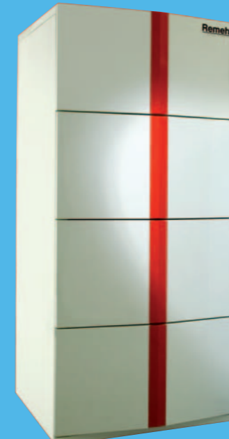
Remeha Gas 110 Range