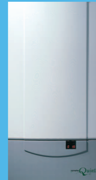
Remeha Quinta Range