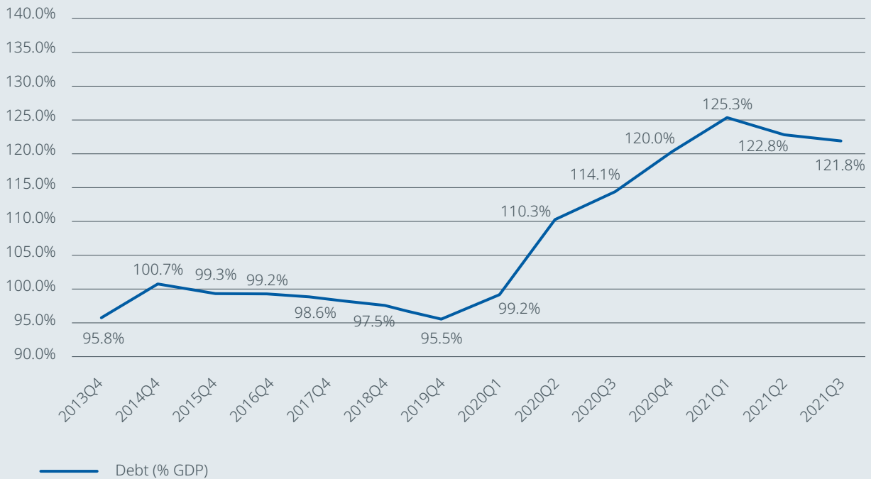
FIGURE 4 Quarterly evolution of the Spanish debt/GDP ratio since 2013 (% of GDP)