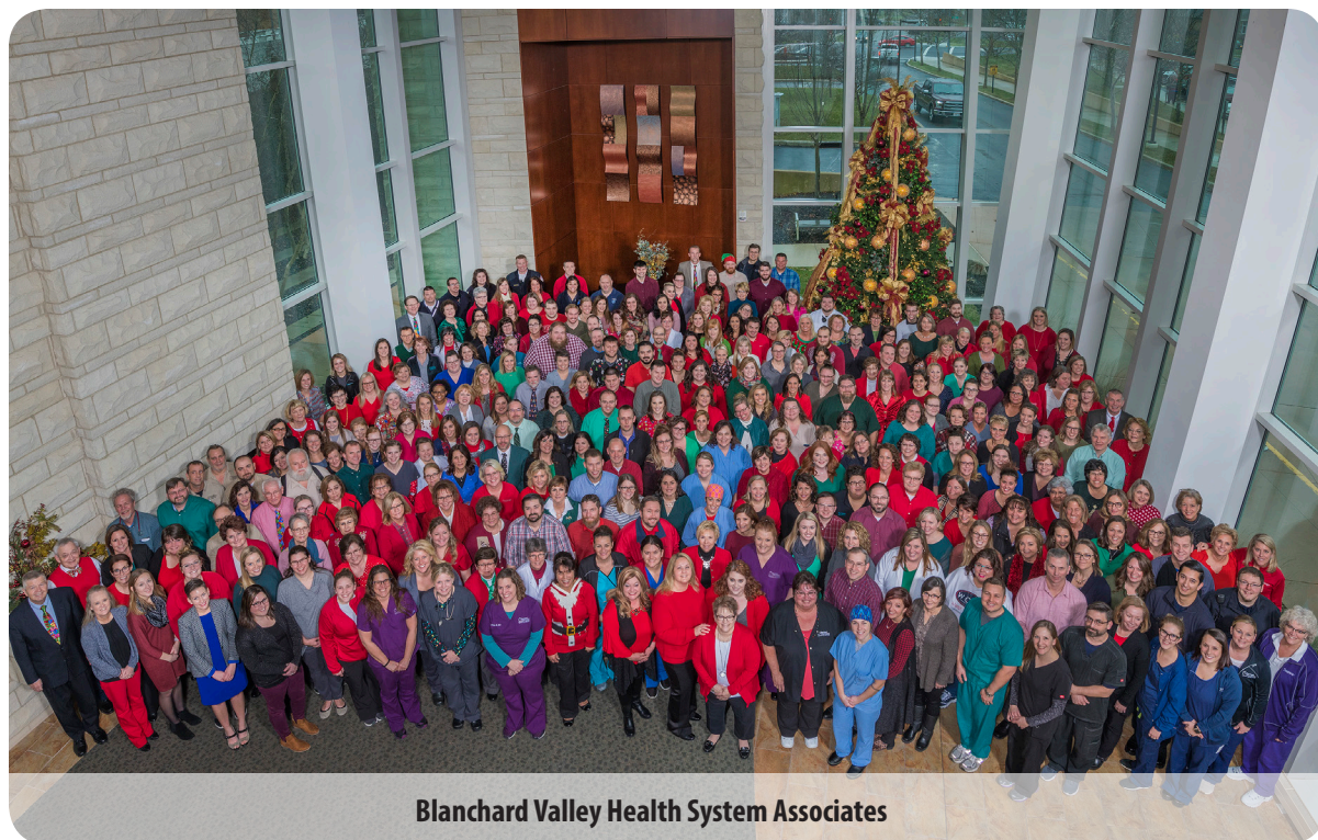
Blanchard Valley Health System Associates