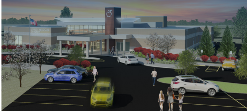
Architectural renderings of the planned patient registration area.

Your investment supports caring for our community so we can care for you -