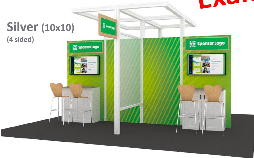
Silver (10x10) (4 sided)