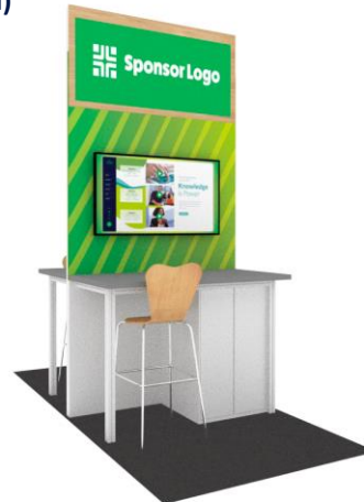
Bronze (5x5) (2 sided)