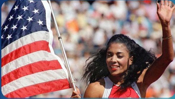
Florence Griffith-Joyner (FloJo)