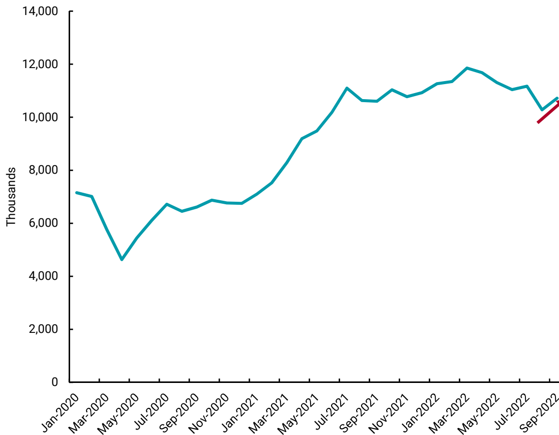
Job Openings: Total Nonfarm

As we think about inflation going forward and, more importantly consider how the Fed thinks about inflation, the labor market is a key variable in how we move forward. There are many aspects of the inflation picture where the Fed has no control, including items like food, energy, and global goods. Still, the domestic economy is driven primarily by the U.S. consumer, and employment, wages and rents are material parts of longer-term inflation.