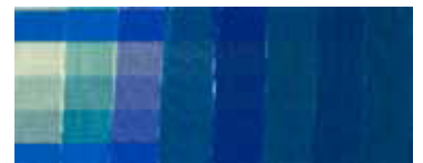
Standard reference blue scale