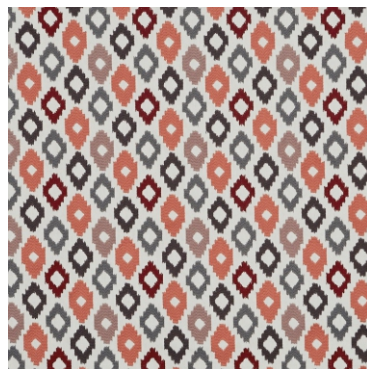
Cassia Passion Fruit