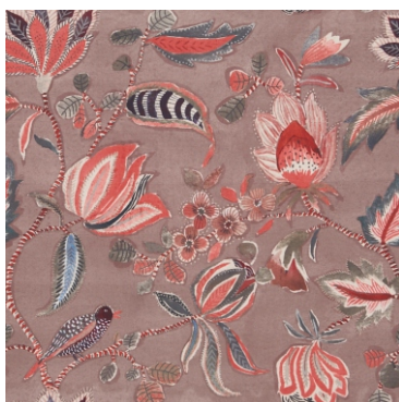
Azalea Passion Fruit