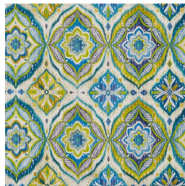
Bowood Sea Grass