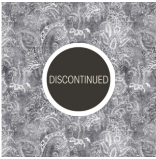
Equator Carbon 100% Cotton 280cm drop (Railroaded) 65cm (Vertical Repeat) Dual Purpose - 20,000 rubs