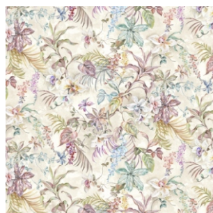
Greenhouse Mist 100% Cotton 280cm drop (Railroaded) 100cm (Vertical Repeat) Dual Purpose - 20,000 rubs