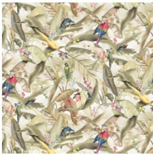
Macaw Parchment 100% Cotton 280cm drop (Railroaded) 66cm (Vertical Repeat) Dual Purpose - 20,000 rubs