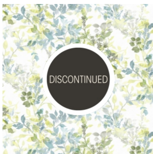
Mangrove Moss 100% Cotton 280cm drop (Railroaded) 70cm (Vertical Repeat) Dual Purpose - 20,000 rubs