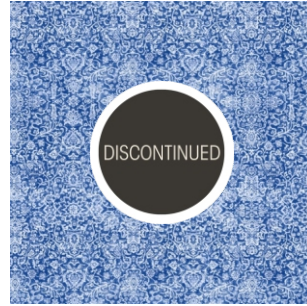
Arabesque Delft 100% Cotton 280cm drop (Railroaded) 65cm (vertical repeat) Dual Purpose - 20,000 rubs