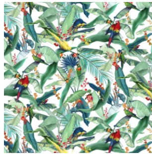
Macaw Primary 100% Cotton 280cm drop (Railroaded) 66cm (Vertical Repeat) Dual Purpose - 20,000 rubs