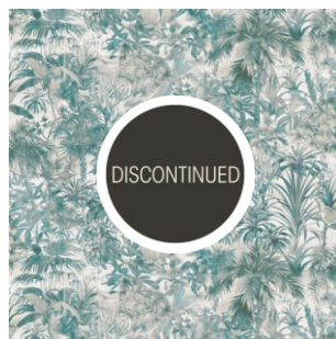
Oasis Lagoon 100% Cotton 280cm drop (Railroaded) 50cm (Vertical Repeat) Dual Purpose - 20,000 rubs