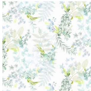
Everglade Mint 100% Cotton 280cm drop (Railroaded) 70cm (Vertical Repeat) Dual Purpose - 20,000 rubs