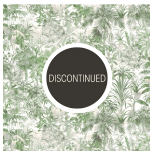
Oasis Malachite 100% Cotton 280cm drop (Railroaded) 50cm (Vertical Repeat) Dual Purpose - 20,000 rubs