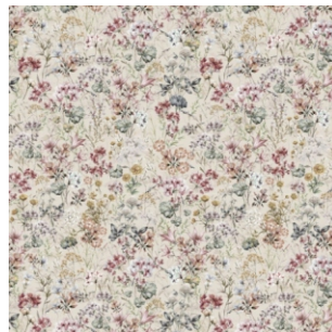
Floriana Heather 100% Cotton 280cm drop (Railroaded) 65cm (Vertical Repeat) Dual Purpose - 20,000 rubs