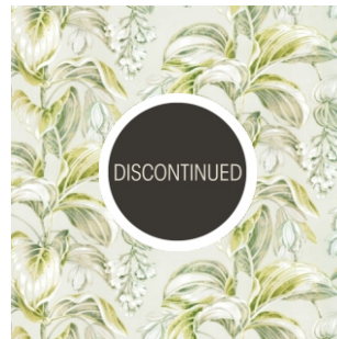
Delicious Linden 100% Cotton 280cm drop (Railroaded) 65cm (Vertical Repeat) Dual Purpose - 20,000 rubs