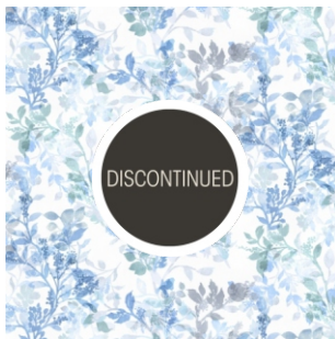
Mangrove Capri 100% Cotton 280cm drop (Railroaded) 70cm (Vertical Repeat) Dual Purpose - 20,000 rubs