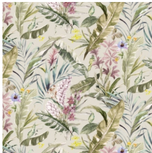
Exotic Blush 100% Cotton 280cm drop (Railroaded) 50cm (Vertical Repeat) Dual Purpose - 20,000 rubs