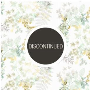
Everglade Celadon 100% Cotton 280cm drop (Railroaded) 70cm (Vertical Repeat) Dual Purpose - 20,000 rubs