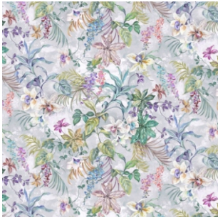
Greenhouse Orchid 100% Cotton 280cm drop (Railroaded) 100cm (Vertical Repeat) Dual Purpose - 20,000 rubs