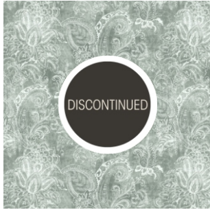
Equator Sage 100% Cotton 280cm drop (Railroaded) 65cm (Vertical Repeat) Dual Purpose - 20,000 rubs