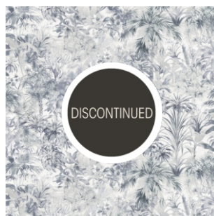
Oasis Phantom 100% Cotton 280cm drop (Railroaded) 50cm (Vertical Repeat) Dual Purpose - 20,000 rubs