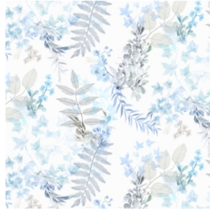
Everglade Azure 100% Cotton 280cm drop (Railroaded) 70cm (Vertical Repeat) Dual Purpose - 20,000 rubs