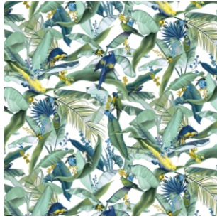
Macaw Jade 100% Cotton 280cm drop (Railroaded) 66cm (Vertical Repeat) Dual Purpose - 20,000 rubs