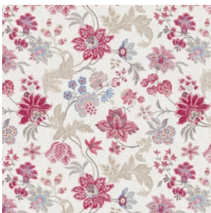
Enchanting Coral 100% Cotton 280cm drop (Railroaded) 64cm (Vertical Repeat) Dual Purpose - 20,000 rubs