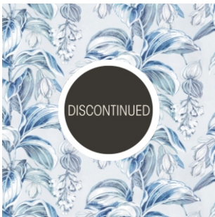
Delicious Aquamarine 100% Cotton 280cm drop (Railroaded) 65cm (Vertical Repeat) Dual Purpose - 20,000 rubs