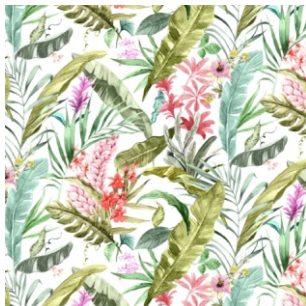
Exotic Sangria 100% Cotton 280cm drop (Railroaded) 50cm (Vertical Repeat) Dual Purpose - 20,000 rubs