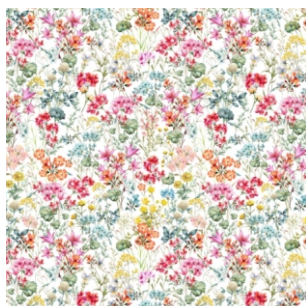
Floriana Spring 100% Cotton 280cm drop (Railroaded) 65cm (Vertical Repeat) Dual Purpose - 20,000 rubs