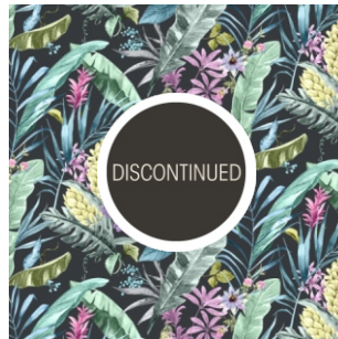
Exotic Jewel 100% Cotton 280cm drop (Railroaded) 50cm (Vertical Repeat) Dual Purpose - 20,000 rubs