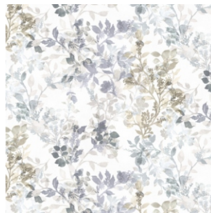
Mangrove Dove 100% Cotton 280cm drop (Railroaded) 70cm (Vertical Repeat) Dual Purpose - 20,000 rubs