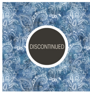
Equator Indigo 100% Cotton 280cm drop (Railroaded) 65cm (Vertical Repeat) Dual Purpose - 20,000 rubs