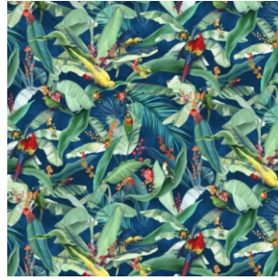
Macaw Midnight 100% Cotton 280cm drop (Railroaded) 66cm (Vertical Repeat) Dual Purpose - 20,000 rubs