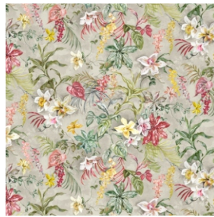
Greenhouse Sienna 100% Cotton 280cm drop (Railroaded) 100cm (Vertical Repeat) Dual Purpose - 20,000 rubs