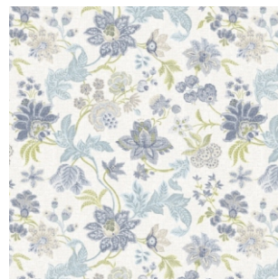
Enchanting Seaside 100% Cotton 280cm drop (Railroaded) 64cm (Vertical Repeat) Dual Purpose - 20,000 rubs