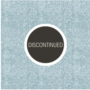
Arabesque Aqua 100% Cotton 280cm drop (Railroaded) 65cm (vertical repeat) Dual Purpose - 20,000 rubs

The Plantation collection, inspired by tropical rainforests and springtime gardens, is printed on a 100% Cotton slub cloth. The assortment of designs are available in fresh summertime and cool autumn shades. All designs are 280cm wide with the pattern running from selvedge to selvedge. Suitable for curtaining, accessories and upholstery, making it the ideal choice this season.