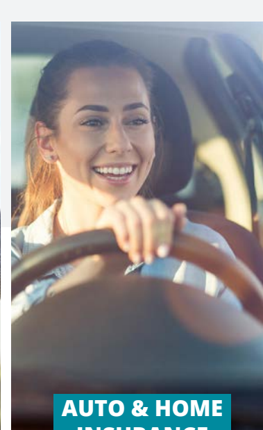
AUTO & HOME INSURANCE