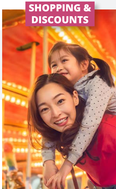
SHOPPING & DISCOUNTS