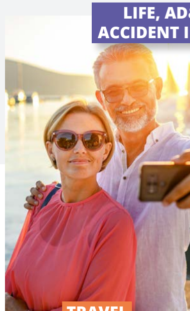
LIFE, AD&D AND ACCIDENT INSURANCE