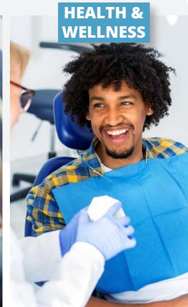
HEALTH & WELLNESS