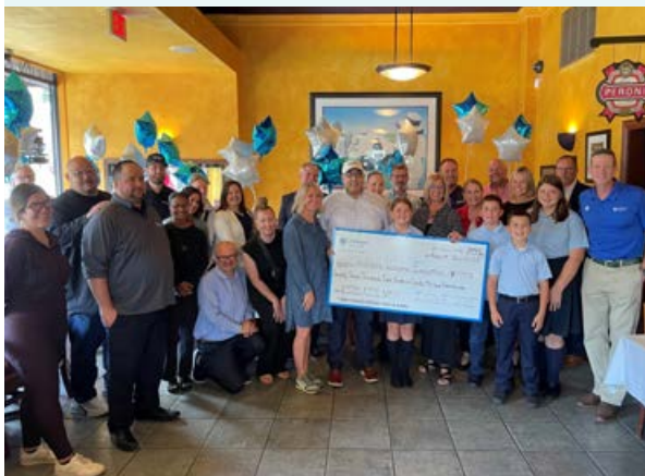
THE DO GOOD WITH FOOD TEAM PRESENTS A CHECK TO CHILDREN'S WISCONSIN