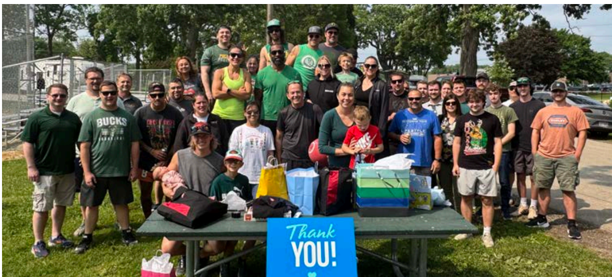
GS GLOBAL RESOURCES KNOWS HOW TO PUT THE "FUN" IN FUNDRAISING THROUGH THEIR EMPLOYEE GIVING CAMPAIGN