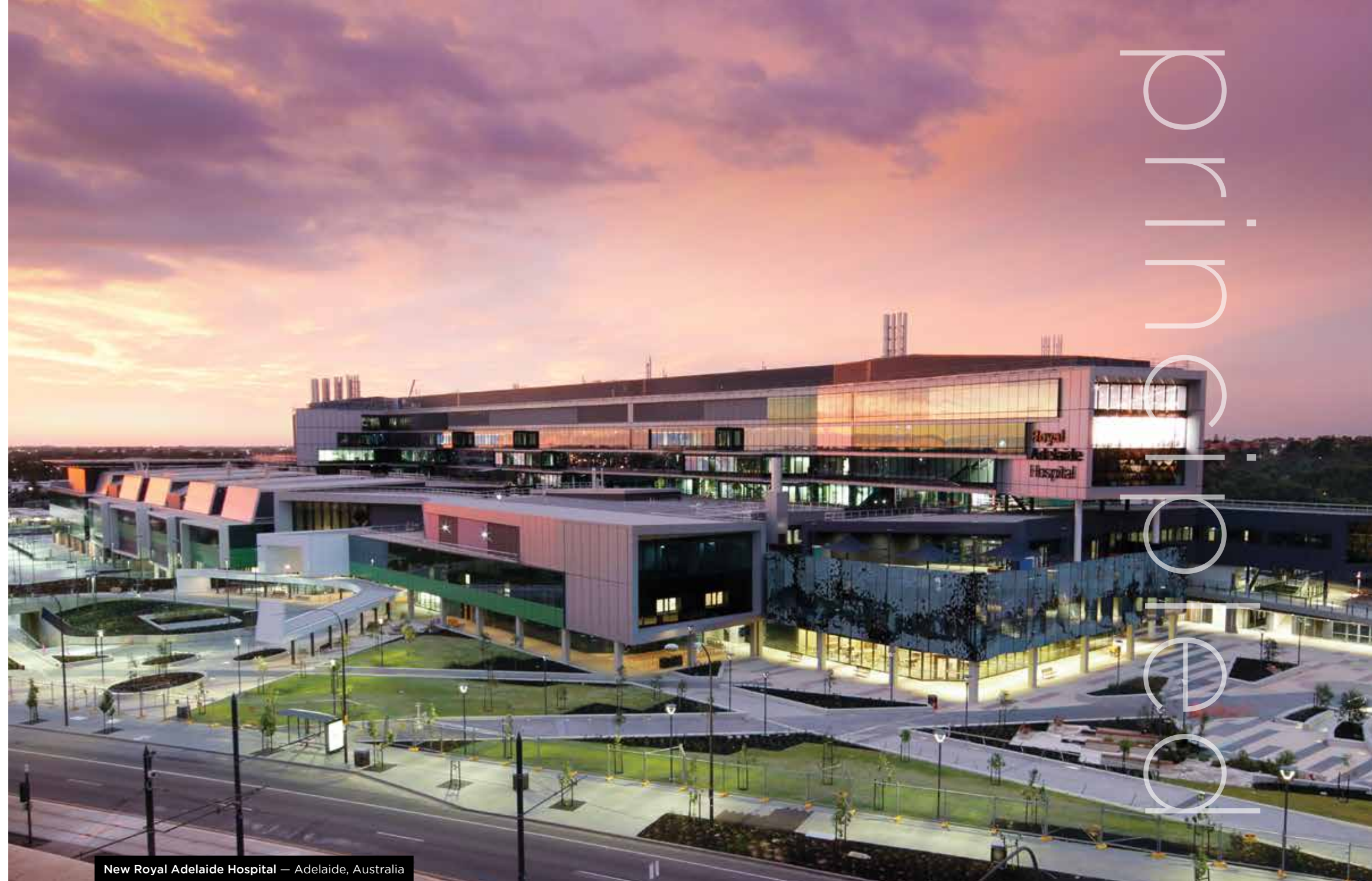
New Royal Adelaide Hospital — Adelaide, Australia

Current projects include major hospital upgrades at Nepean, Campbelltown, Wagga Wagga and Coffs Harbour.