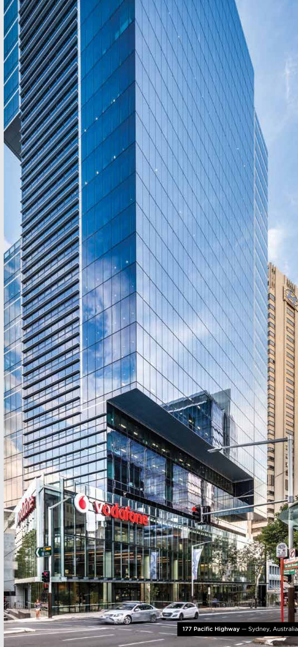
177 Pacific Highway — Sydney, Australia

The architecture of the iconic building promotes the Hiri Moale Festival traditions and cultures and was designed so that, post-APEC, the building could be easily repurposed to accommodate a museum, exhibition and conference centre.