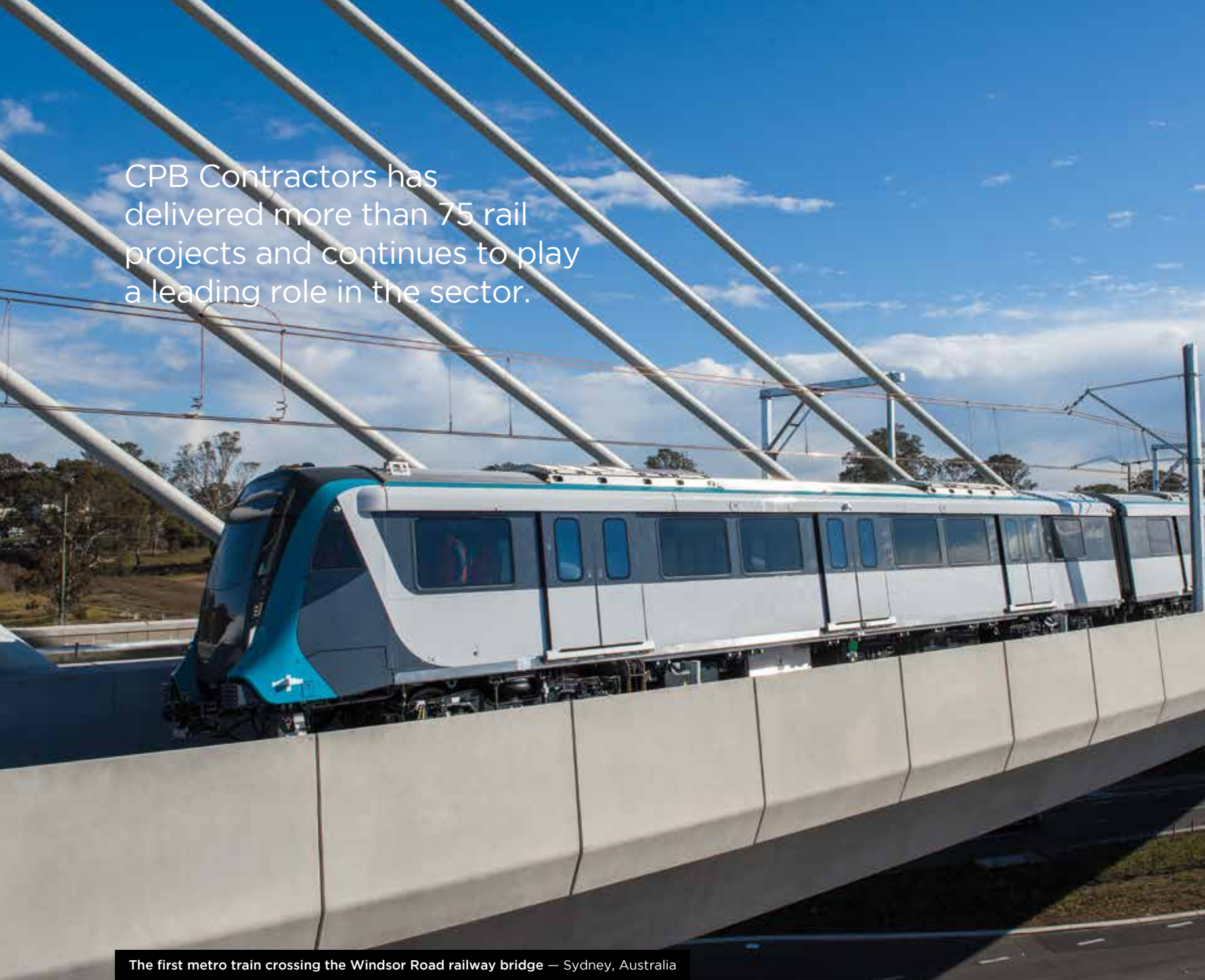
The first metro train crossing the Windsor Road railway bridge — Sydney, Australia

CPB Contractors has delivered more than 75 rail projects and continues to play a leading role in the sector.