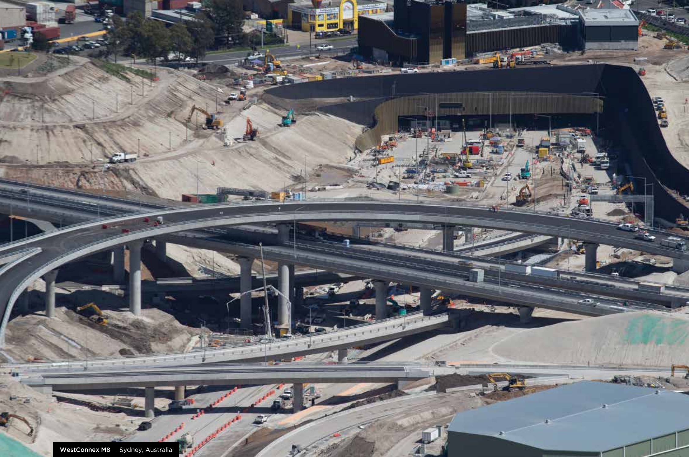
WestConnex M8 — Sydney, Australia