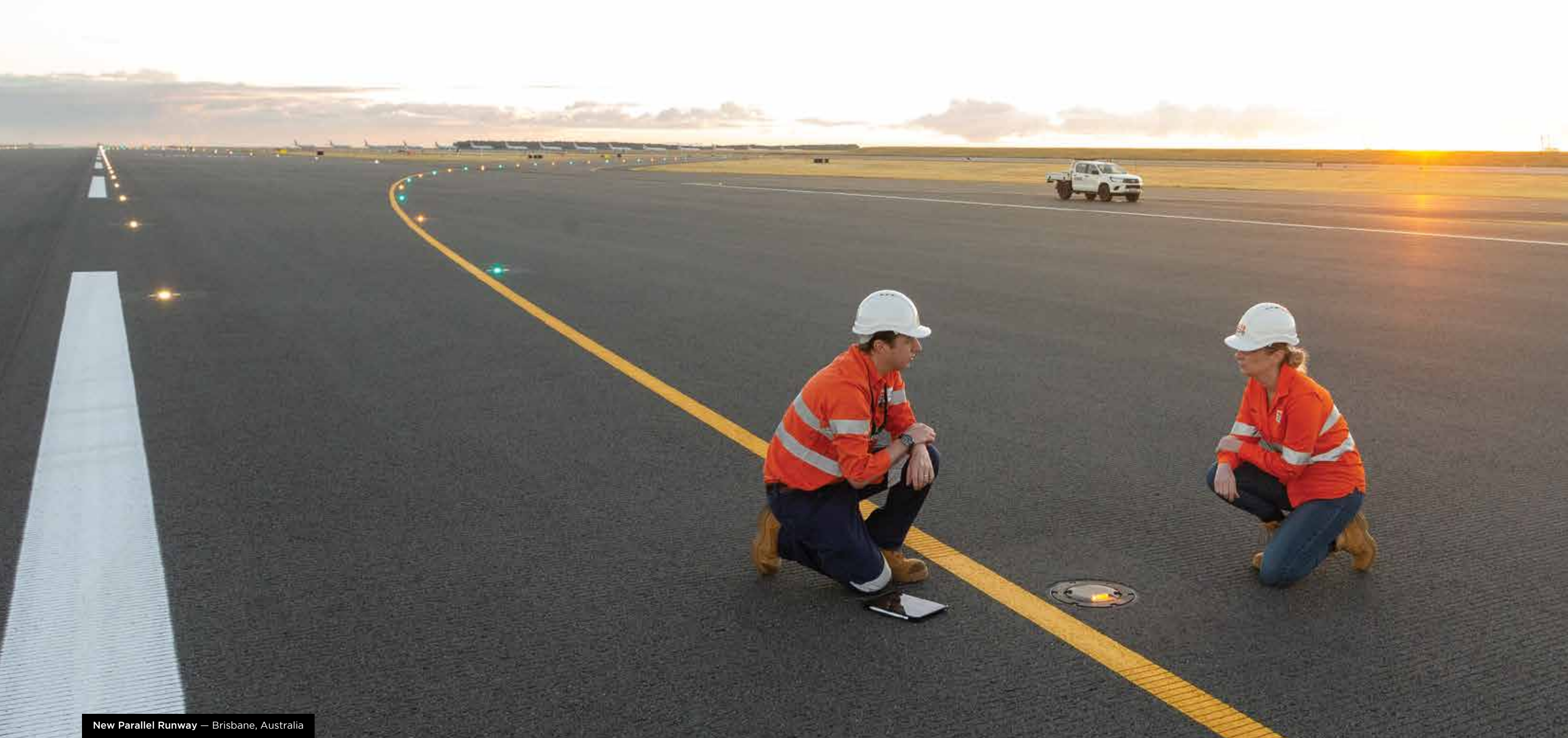
New Parallel Runway — Brisbane, Australia