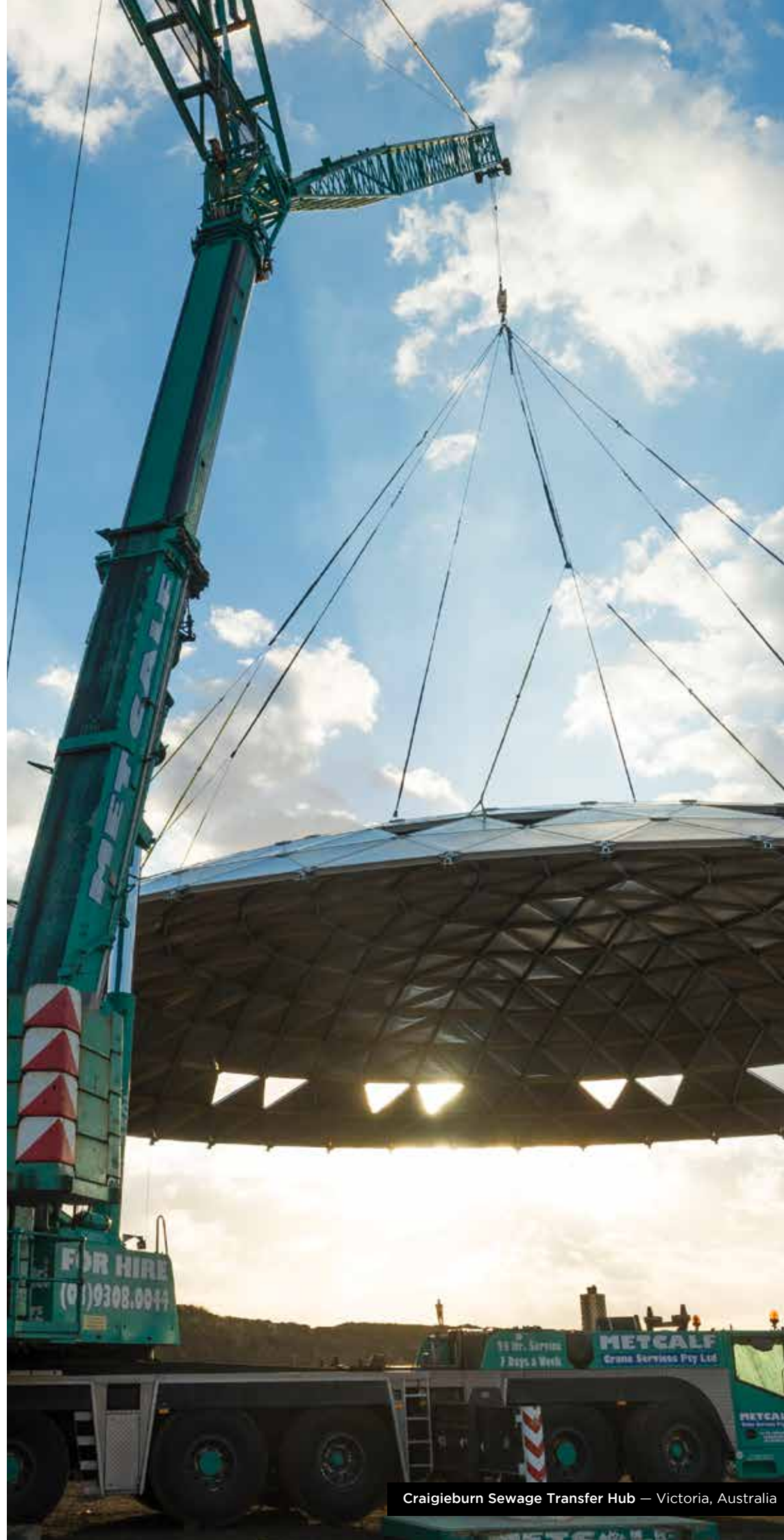
Craigieburn Sewage Transfer Hub — Victoria, Australia

Among our current projects, CPB Contractors and UGL are joint venture partners in an alliance delivering a major capital works program to support and develop Tasmania's water and waste water infrastructure.