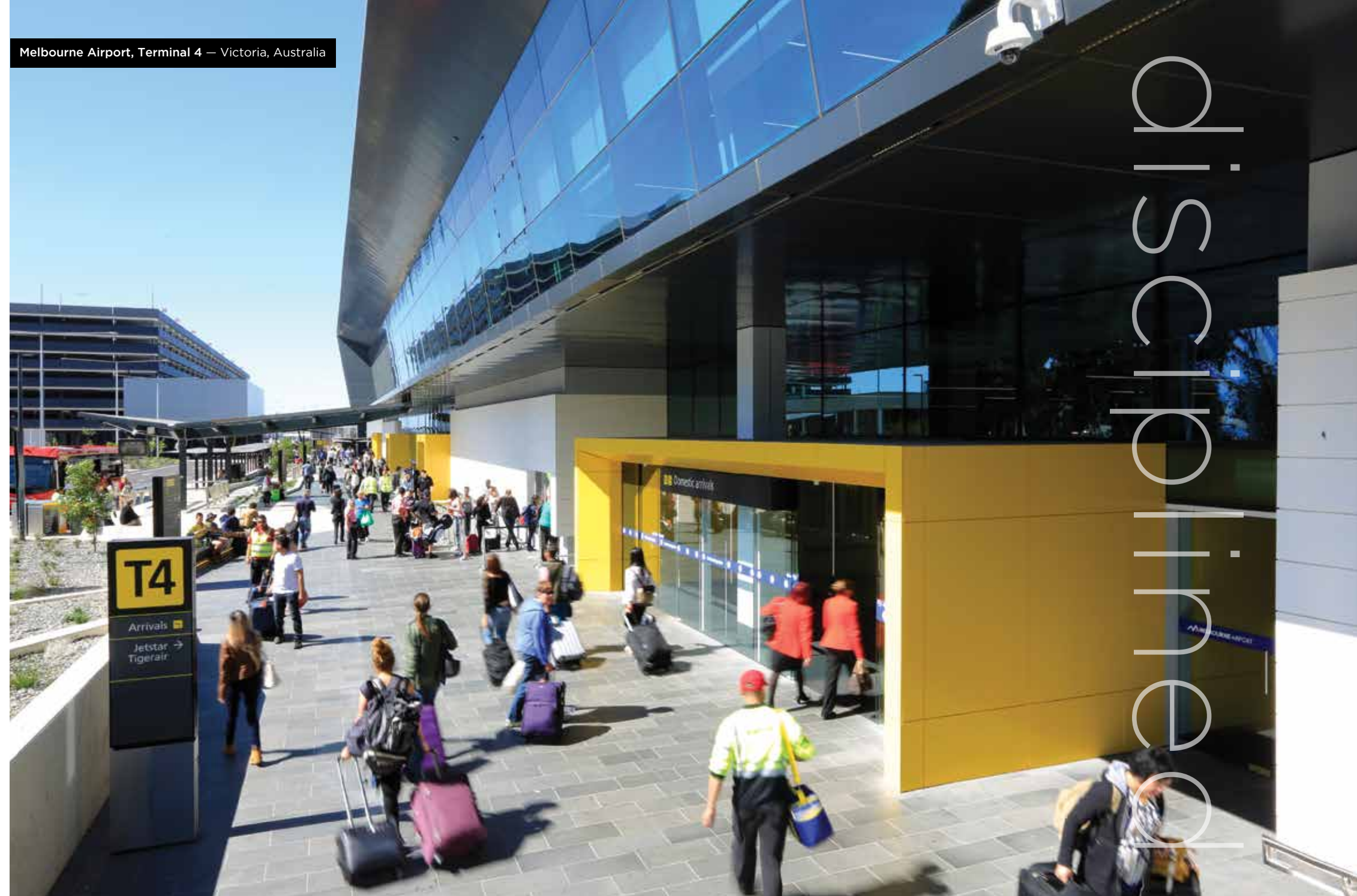
Melbourne Airport, Terminal 4 — Victoria, Australia

CPB Contractors is committed to supporting local economic development and the new parallel runway project inducted more than 3,700 people and engaged 300 subcontractors with 90% of those businesses operating from south-east Queensland.