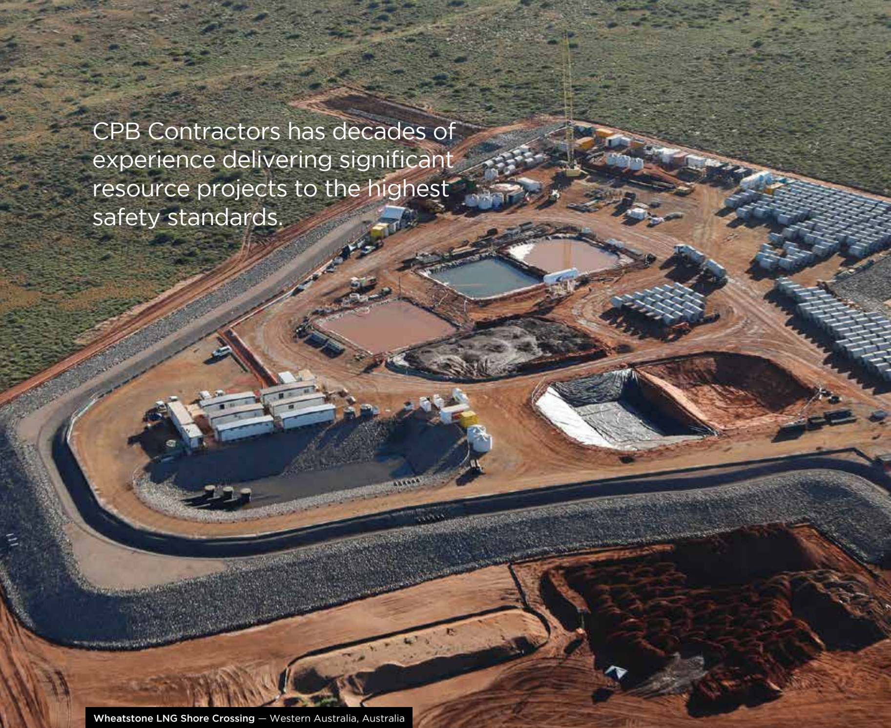
Wheatstone LNG Shore Crossing — Western Australia, Australia

CPB Contractors has decades of experience delivering significant resource projects to the highest safety standards.