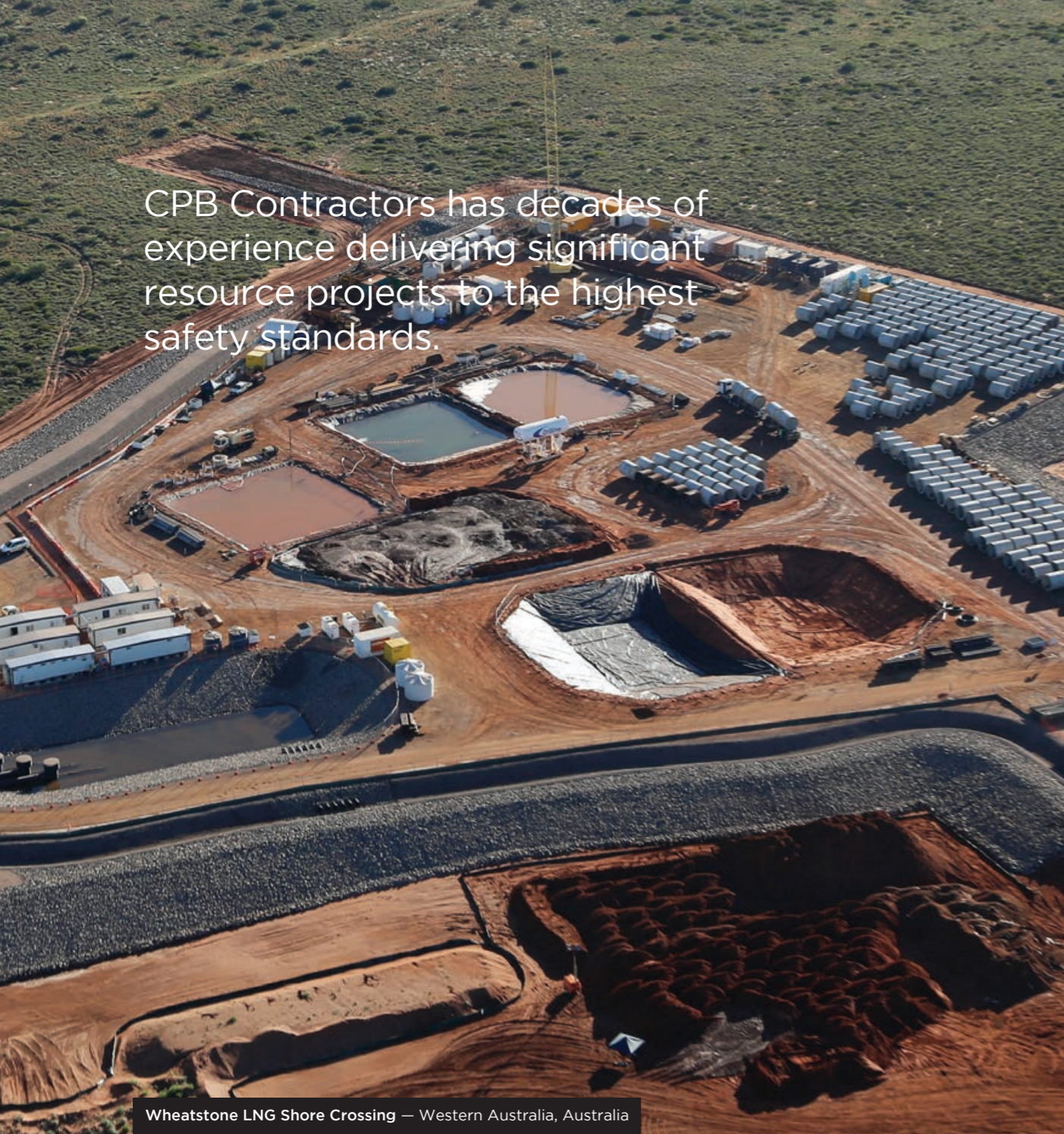
Wheatstone LNG Shore Crossing — Western Australia, Australia

CPB Contractors has decades of experience delivering significant resource projects to the highest safety standards.