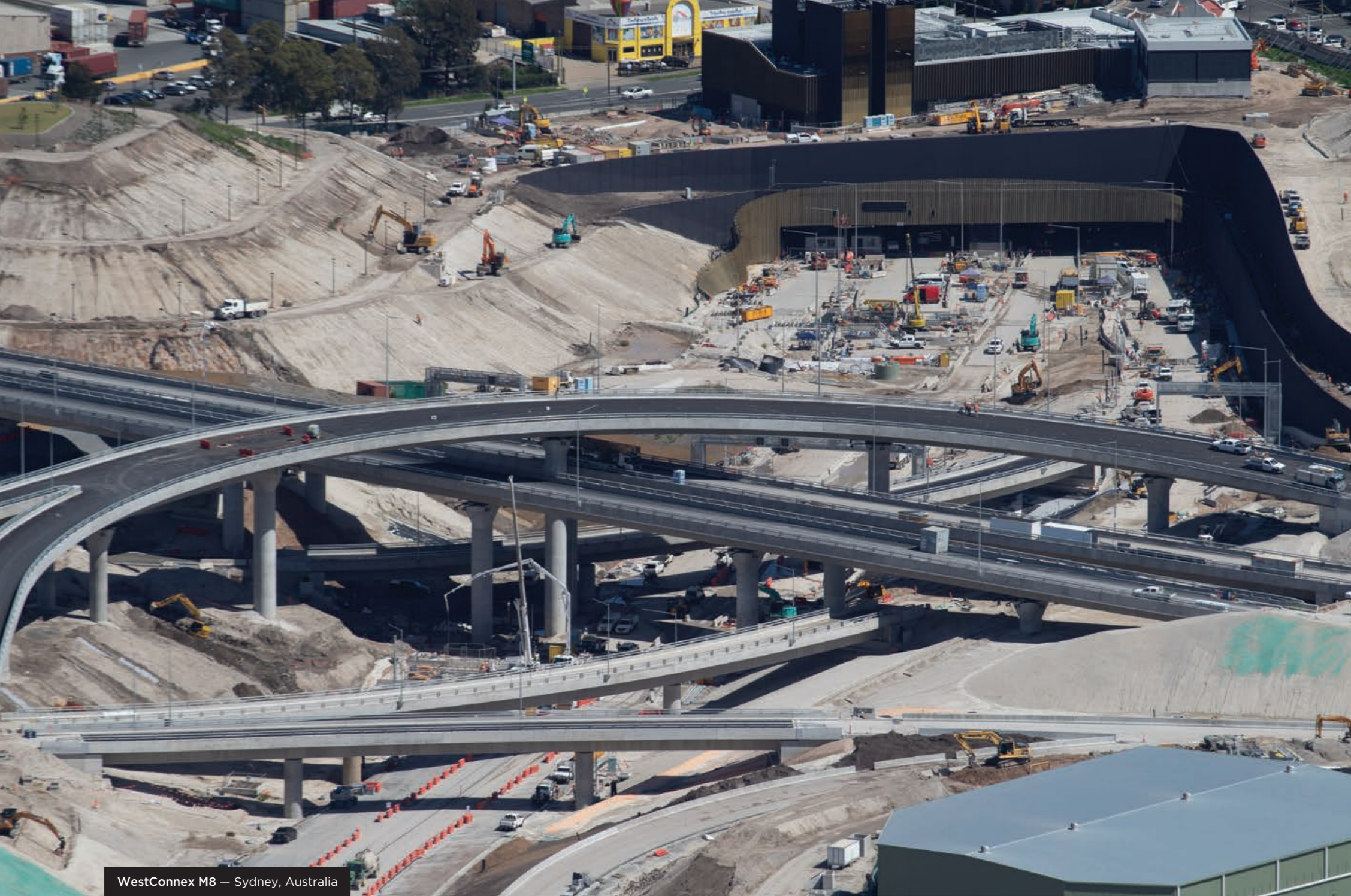
WestConnex M8 — Sydney, Australia