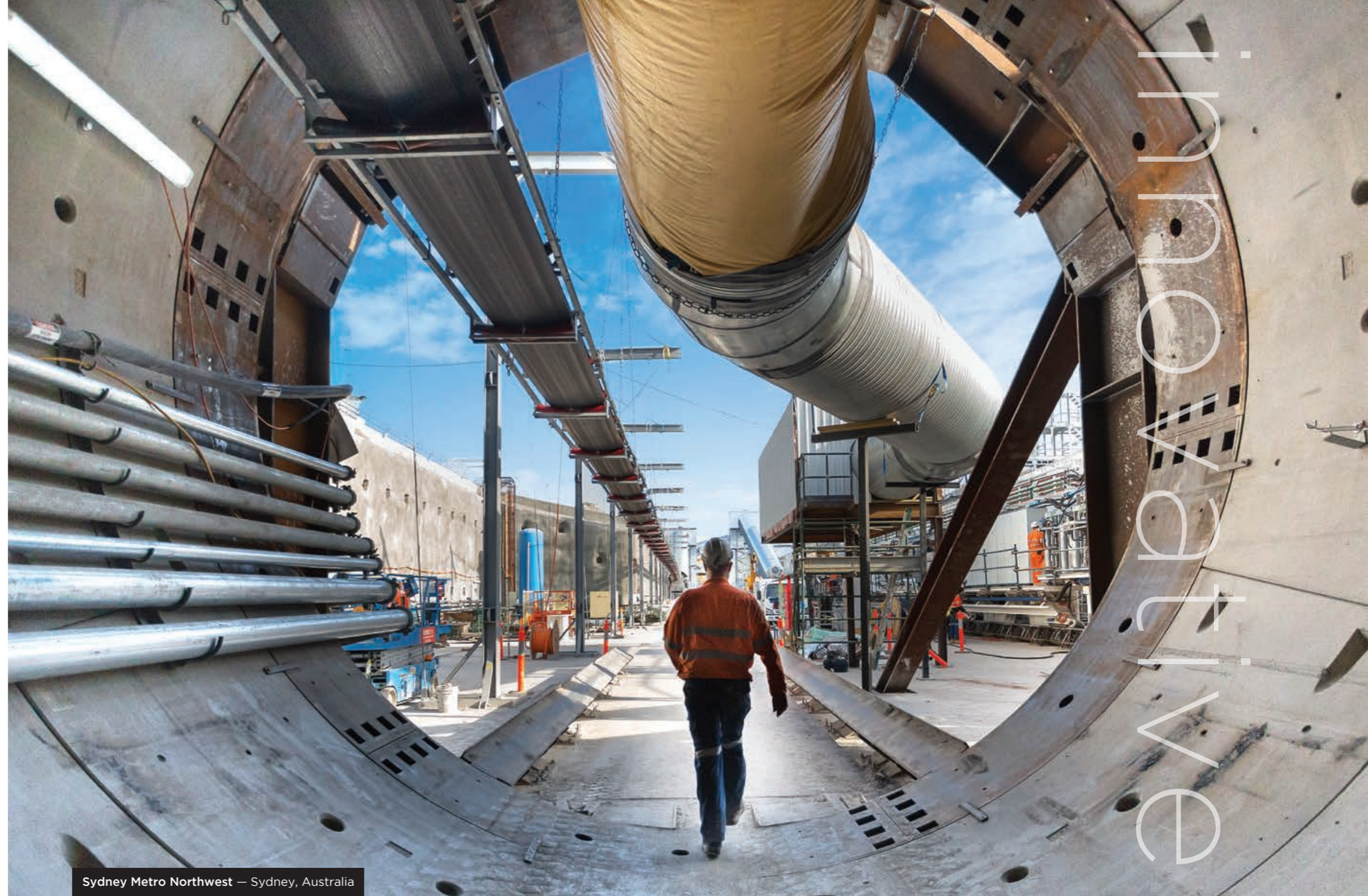
Sydney Metro Northwest — Sydney, Australia

We're currently delivering major tunnels for the WestConnex and Sydney Metro projects in Sydney, Cross River Rail in Brisbane and the West Gate Tunnel in Melbourne.