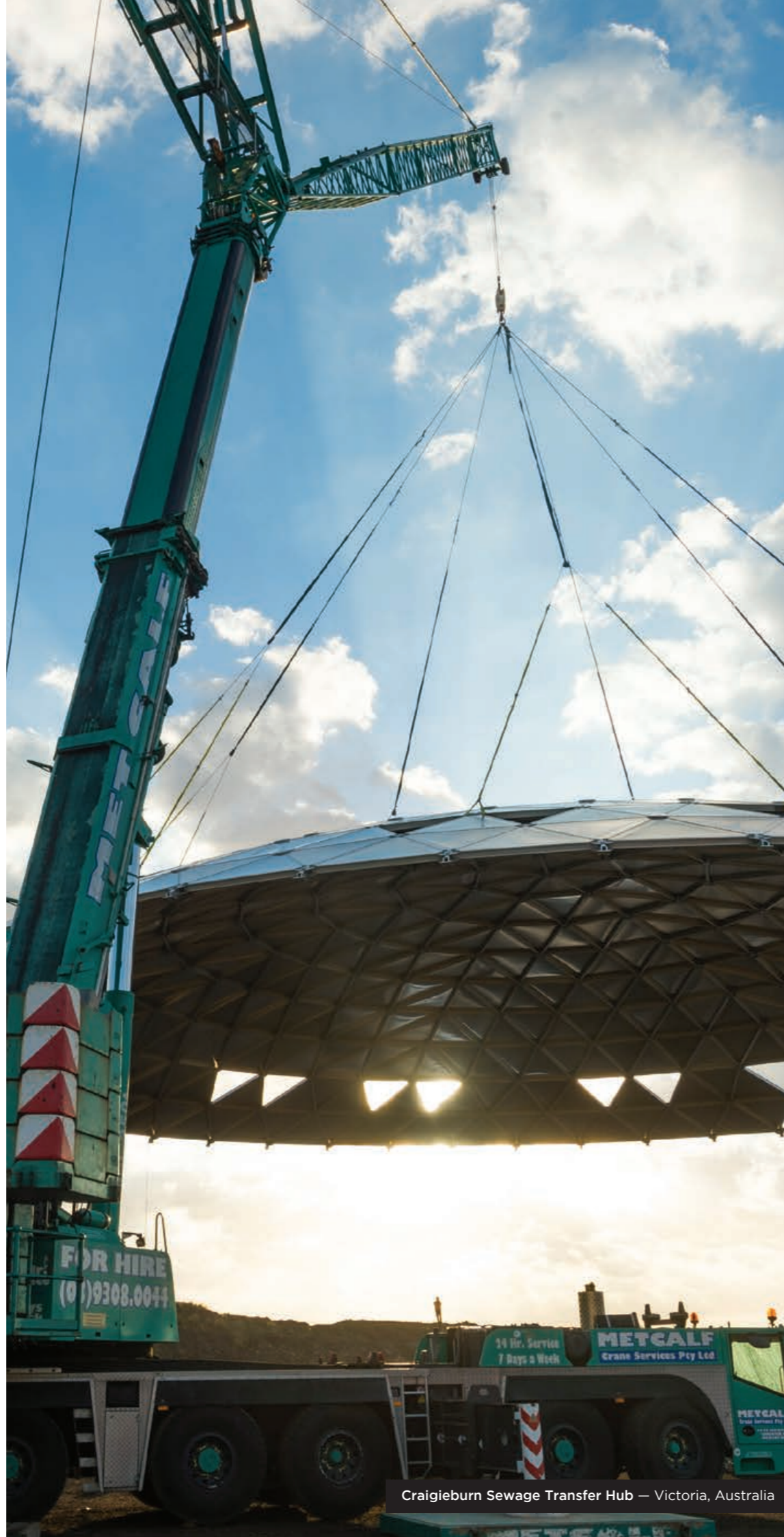
Craigieburn Sewage Transfer Hub — Victoria, Australia

Among our current projects, CPB Contractors and UGL are joint venture partners in an alliance delivering a major capital works program to support and develop Tasmania's water and waste water infrastructure.