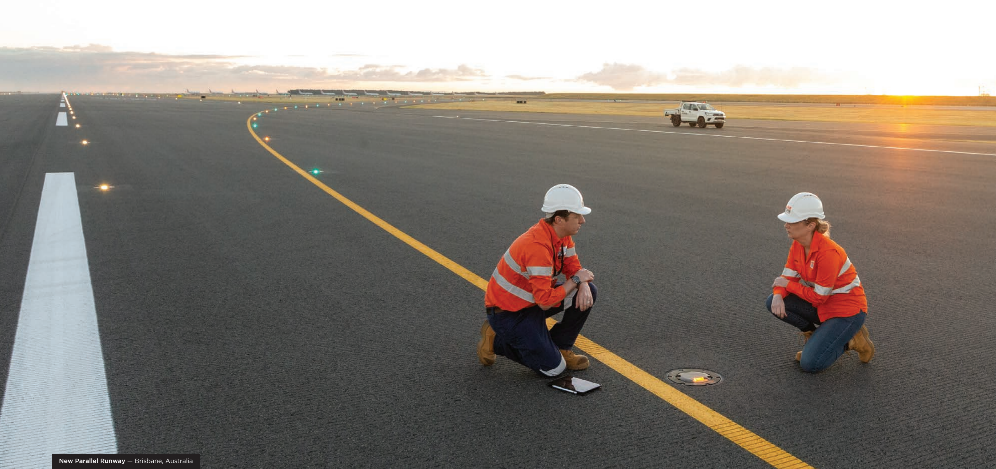
New Parallel Runway — Brisbane, Australia