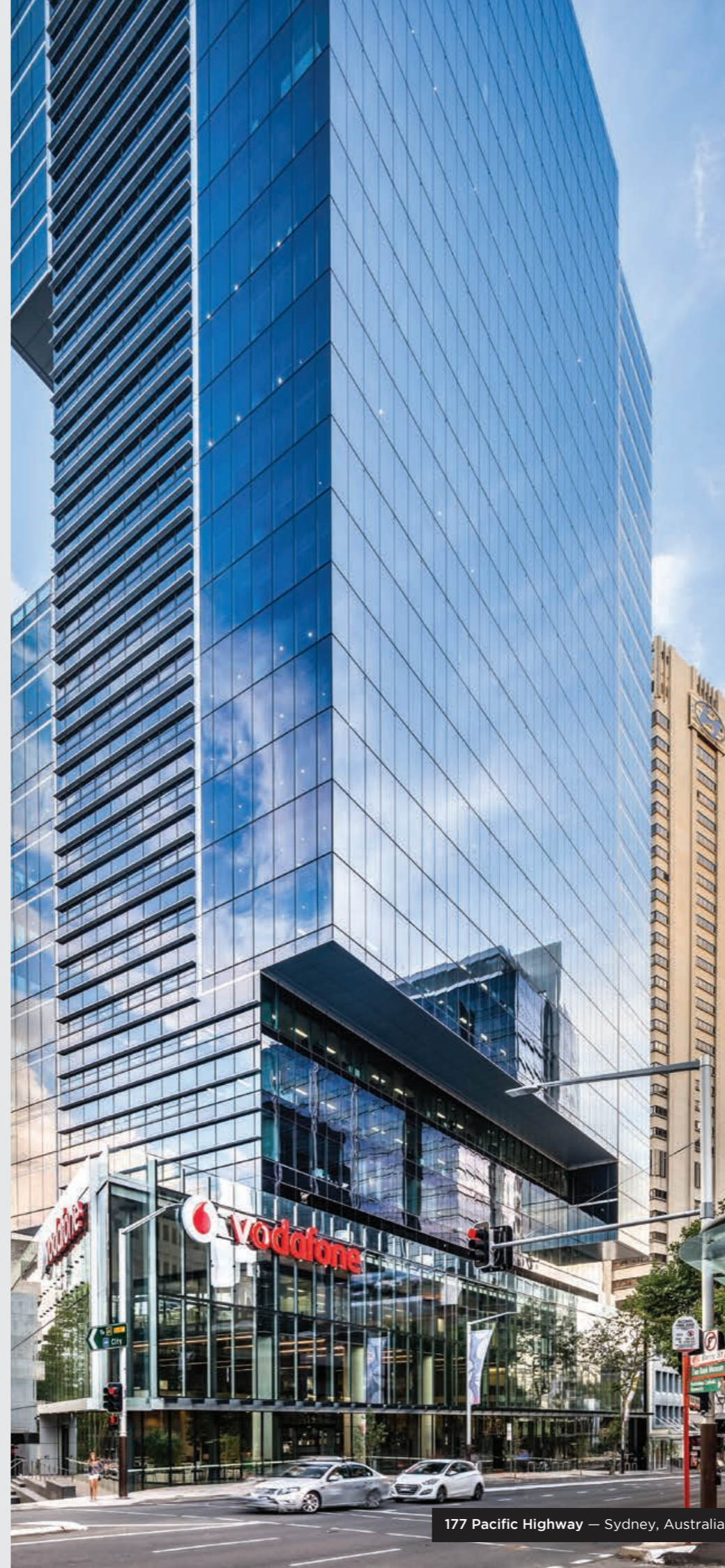
177 Pacific Highway — Sydney, Australia

The architecture of the iconic building promotes the Hiri Moale Festival traditions and cultures and was designed so that, post-APEC, the building could be easily repurposed to accommodate a museum, exhibition and conference centre.