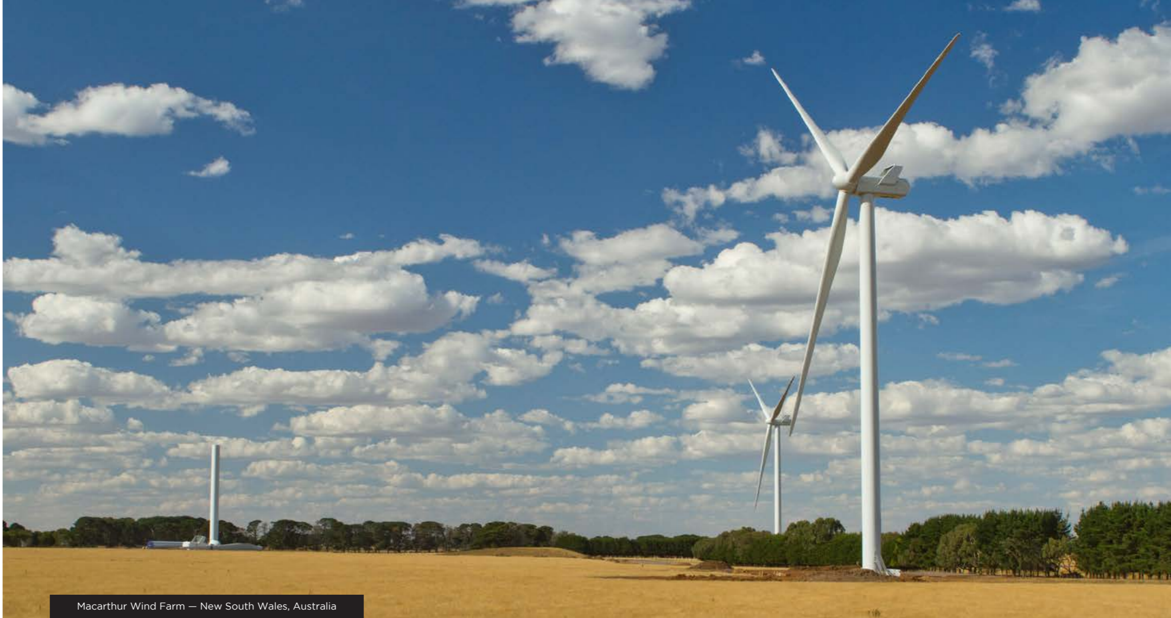
Macarthur Wind Farm — New South Wales, Australia

Our delivery paired with our proven track record of value upgrades and asset enhancements, makes us the construction partner of choice for the energy sector.