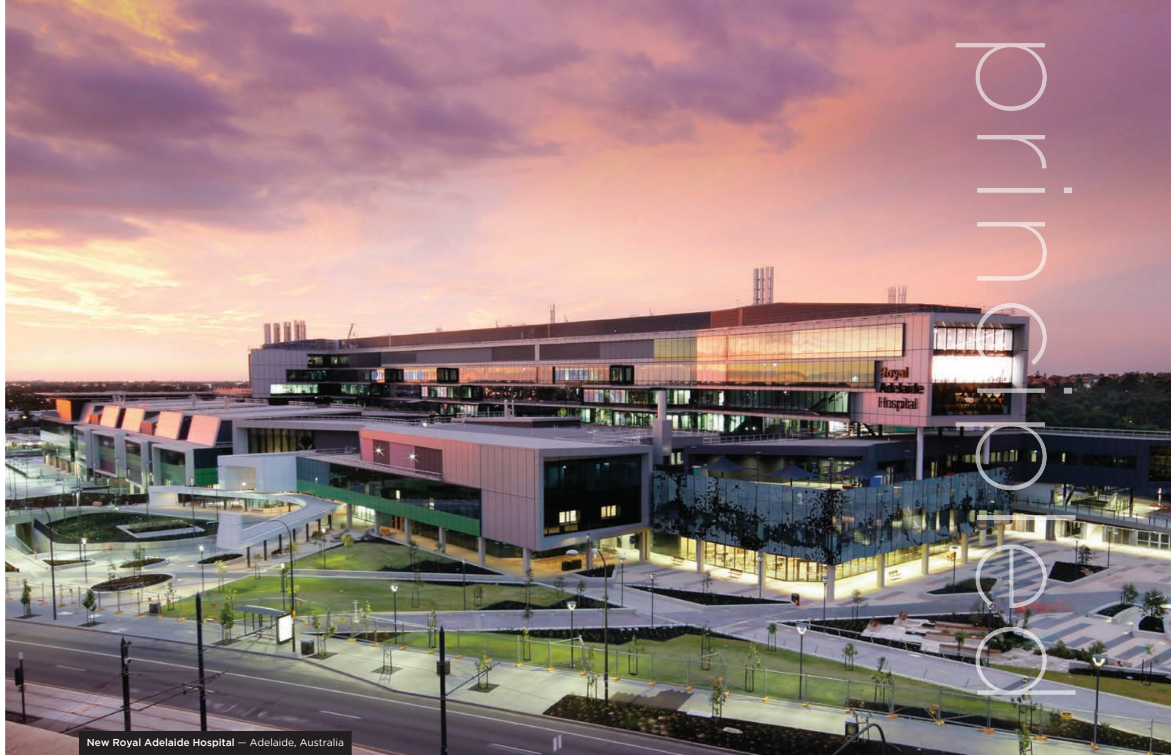
New Royal Adelaide Hospital — Adelaide, Australia

Current projects include major hospital upgrades at Nepean, Campbelltown, Wagga Wagga and Coffs Harbour.