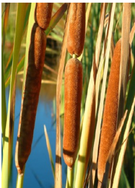
The native Baraba plant