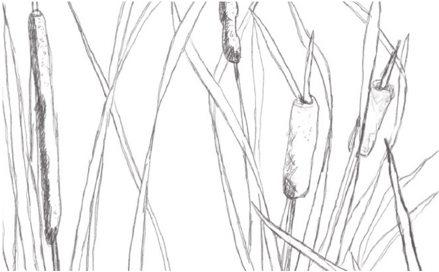
Initial artist sketch of Baraba reeds to be used in the artwork