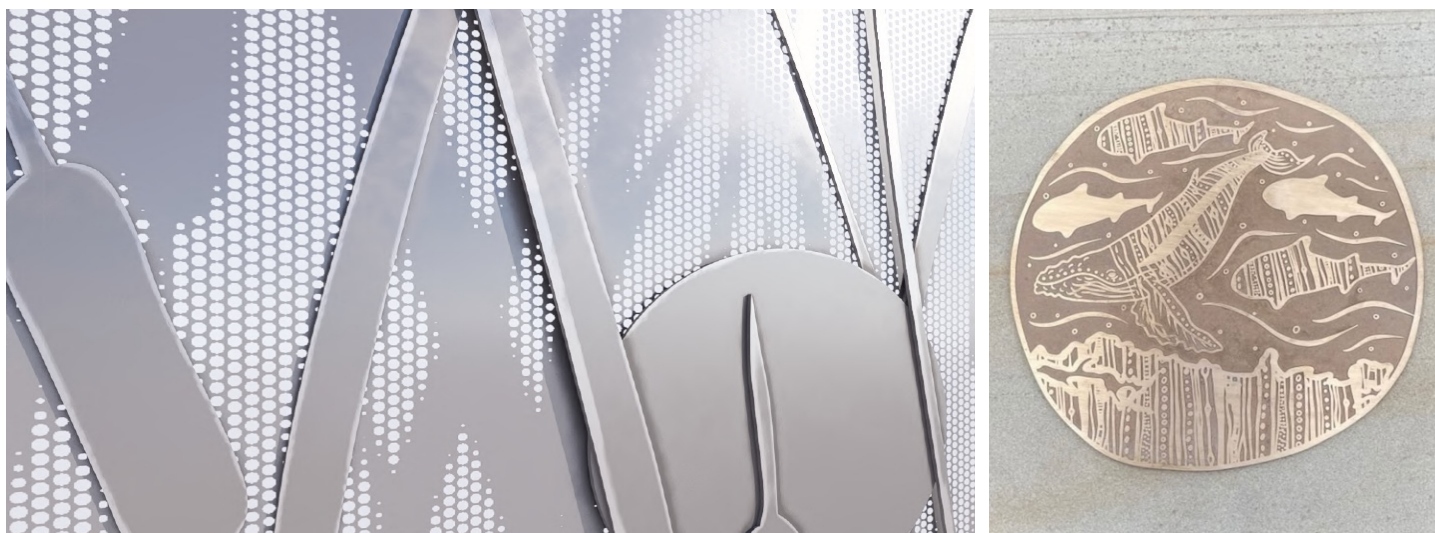
Examples of the Baraba reeds incorporated into the metal installation and the smaller detail depicting "Scenes of Country" and post-colonial elements