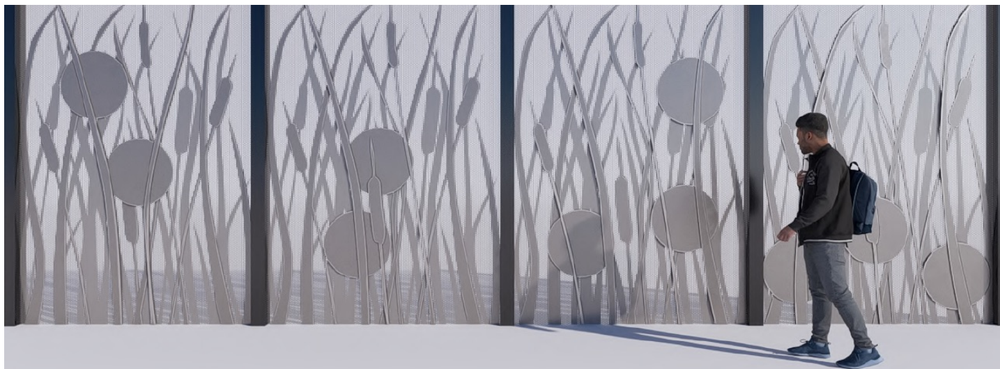
The metal installation is proposed to be placed along the boundary fence at the Edinburgh Road roundabout and be 30 metres long and 3 metres high