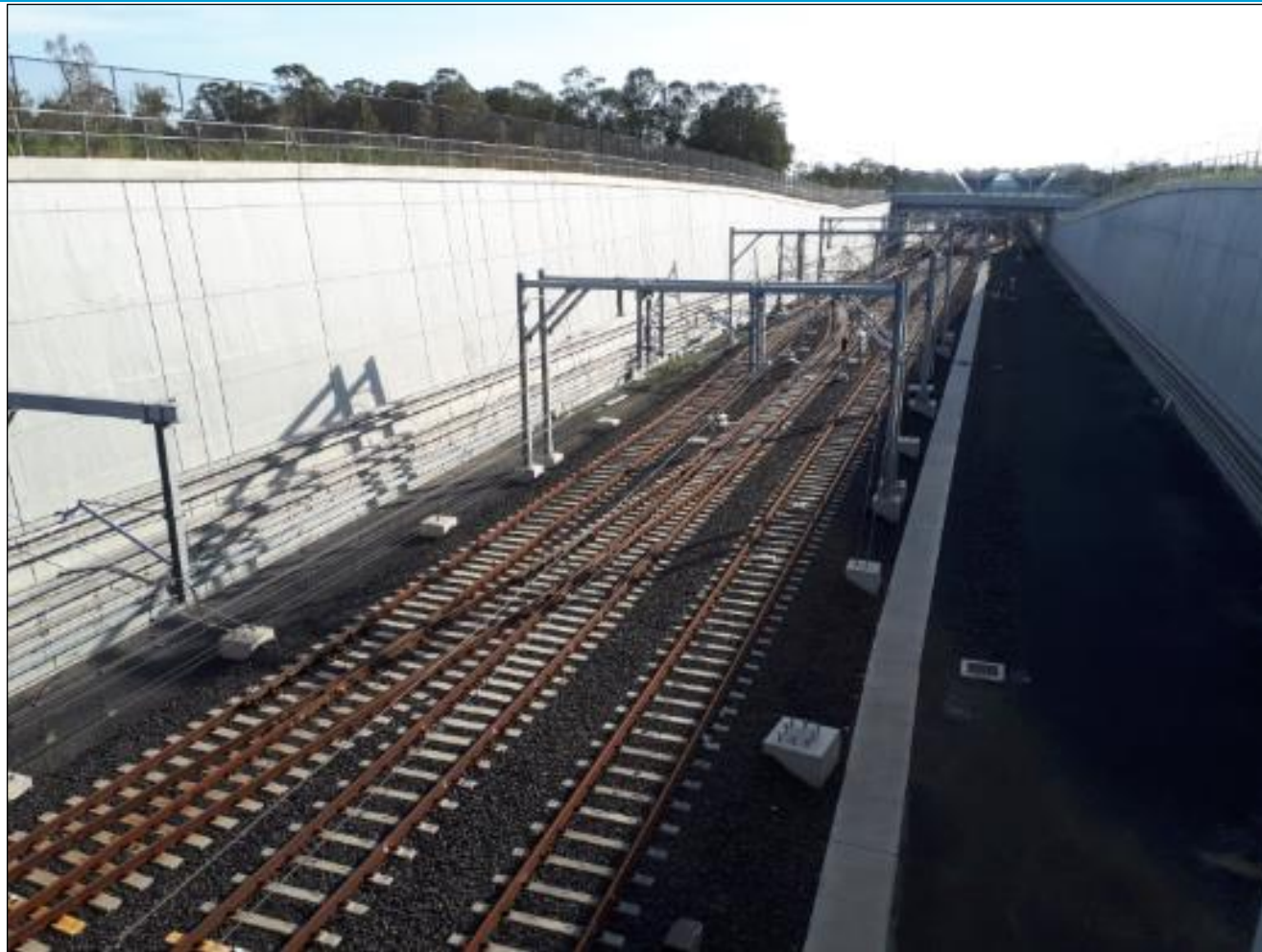
Figure 3: Proposed work area, looking eastwards from Tallawong Rd Overbridge