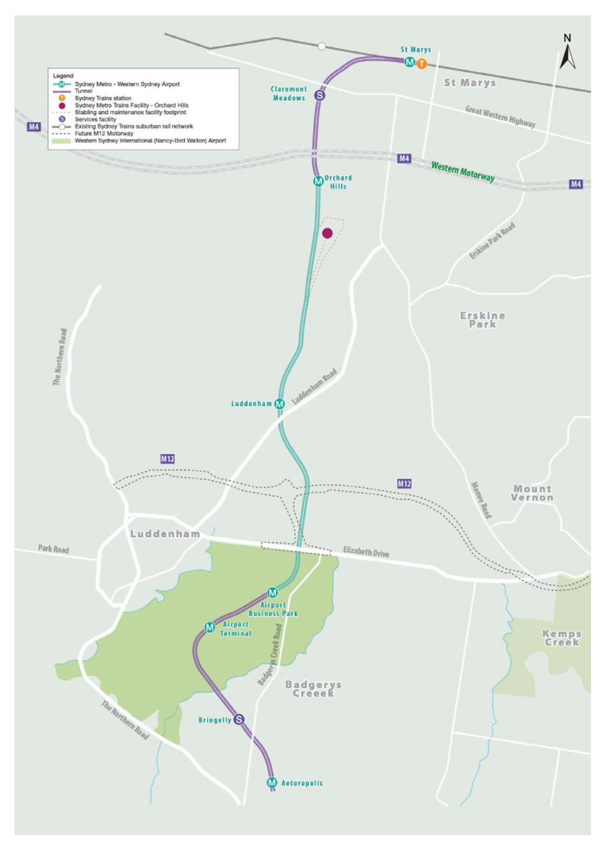
Figure 1: Overview of the Project