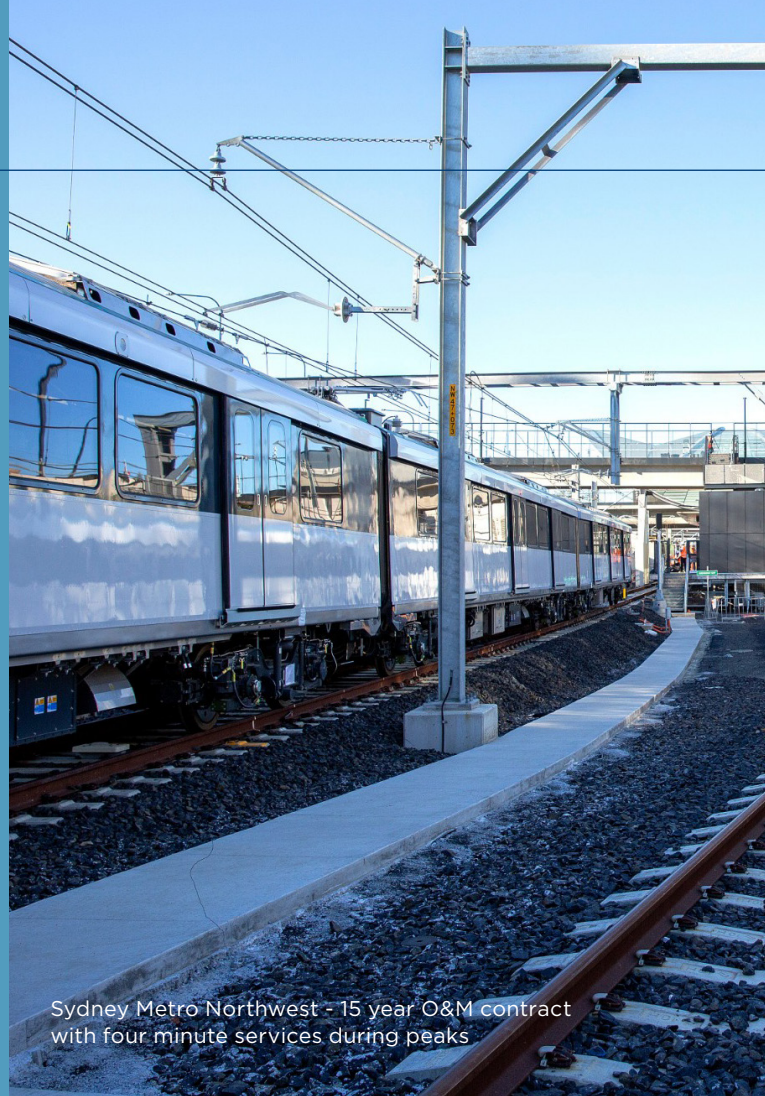
Sydney Metro Northwest - 15 year O&M contract with four minute services during peaks

Sydney Metro Northwest opened in May 2019. UGL is proud to be a partner in this transformational project, which was delivered on time and $1 billion under budget.