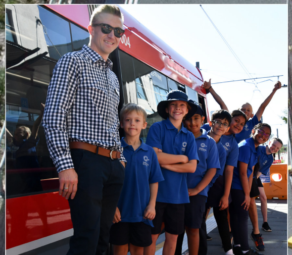
Canberra Metro – 20 year O&M concession, delivering services at 6 minutes intervals during peaks