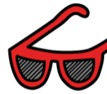
put on sunglasses

I say hello to the dentist. The dentist is very friendly. I wear sunglasses to protect my eyes. If I am nervous I can help put the glasses on.