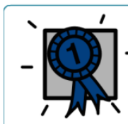
pick a prize

We talk to the dentist. When the dentist is done, I get a sticker for being a great helper. I did a great job. Everyone is proud of me.