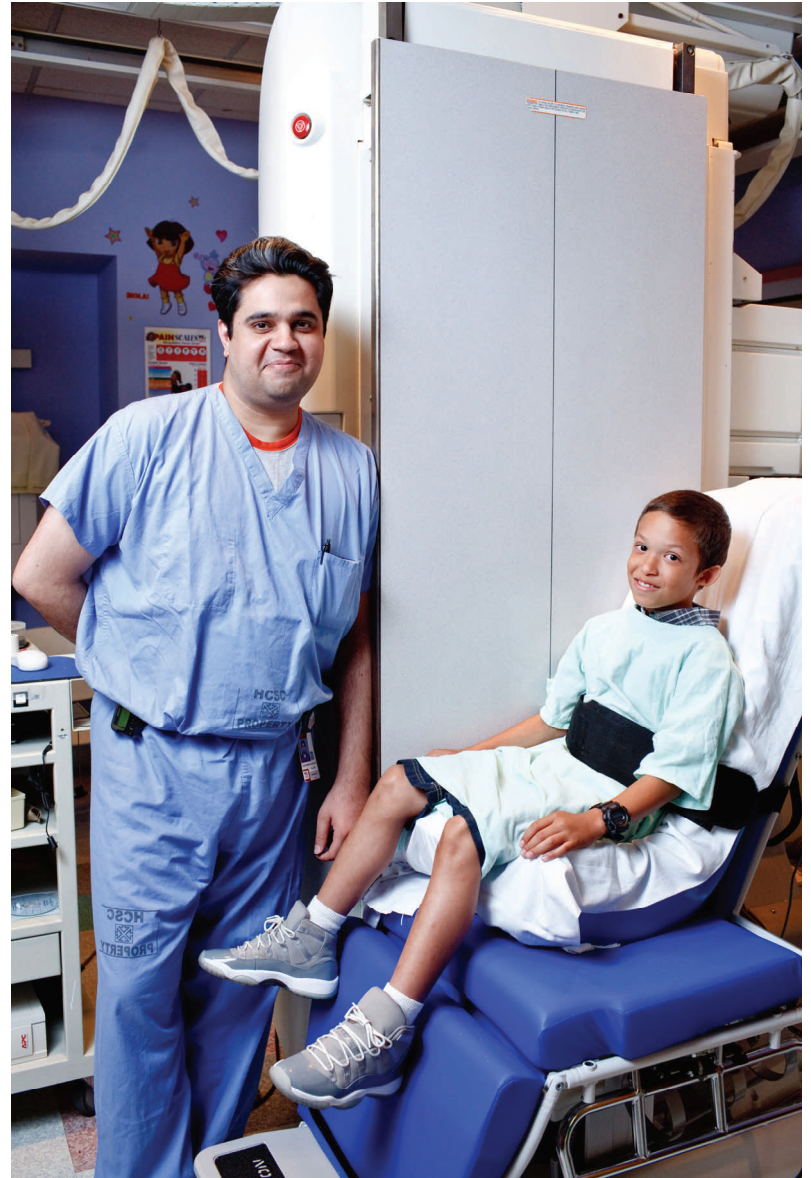
Patient in Fluoroscopy Room in Hospital Gown