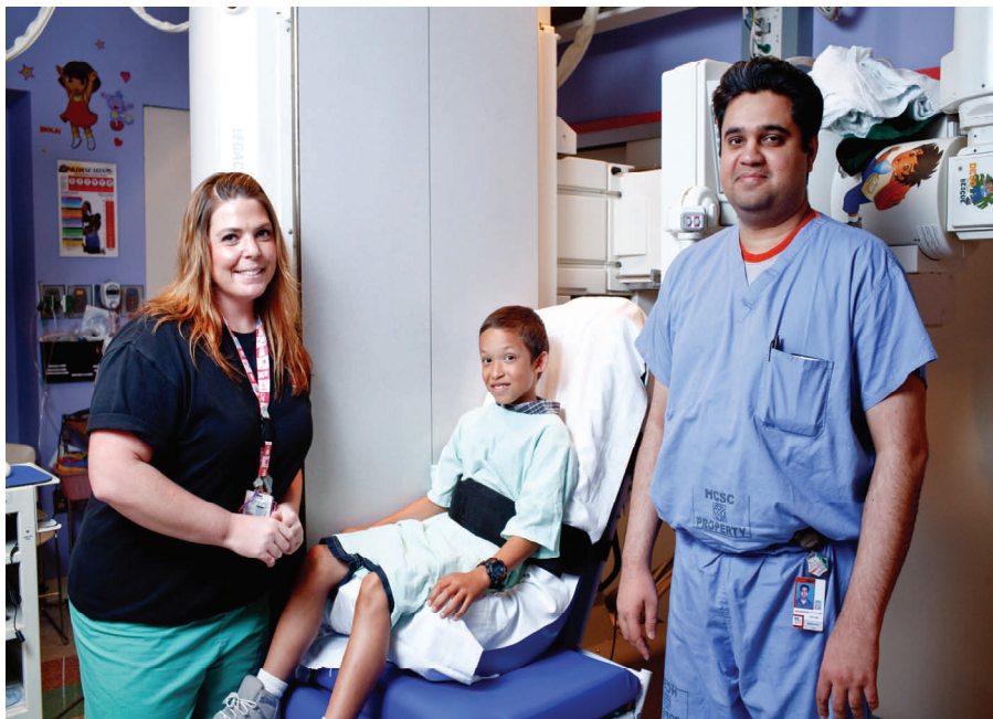
Technologist, Radiologist and Patient in Fluoroscopy Room