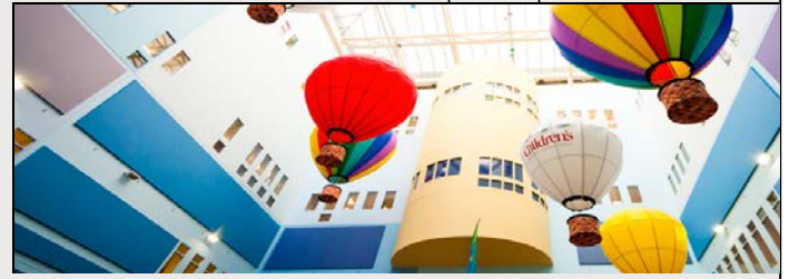
The atrium of Children's National – main hospital campus