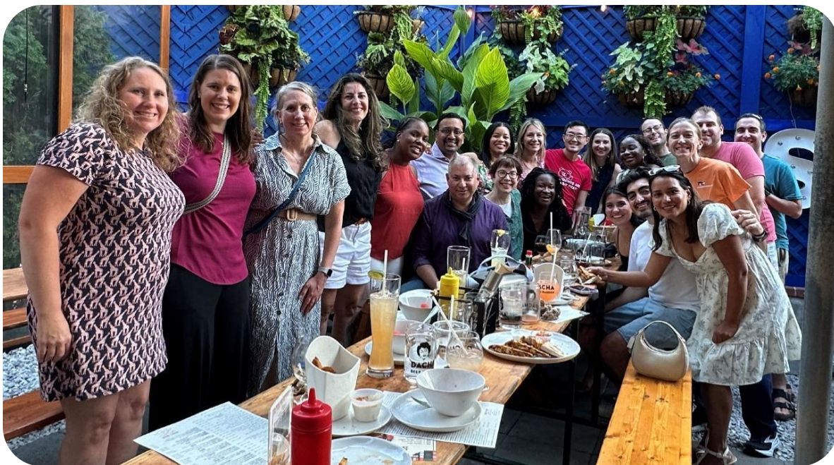
New Fellow Happy Hour 2025