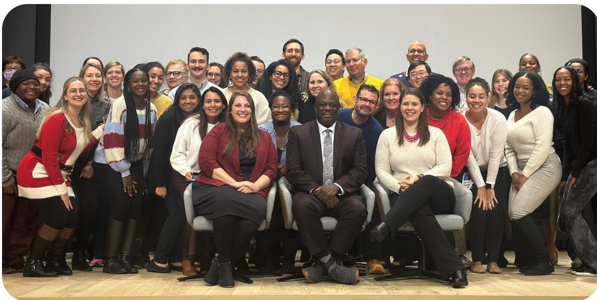
Annual Advocacy Day Fall 2024