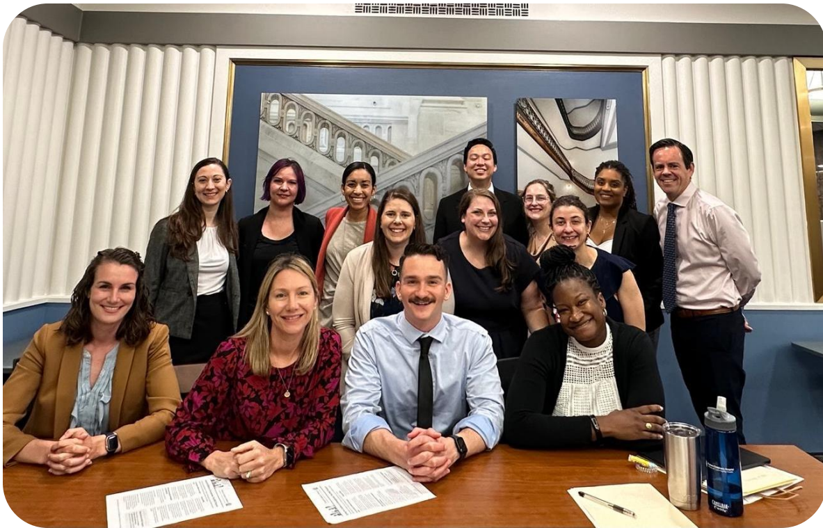
Advocacy day on The Hill Spring 2024