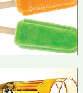
Apple juice (pulp-free)