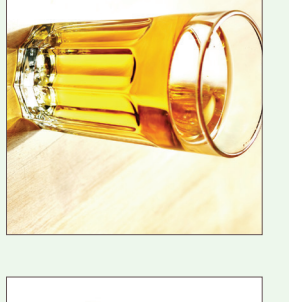
(such as Gatorade™) Sports drinks