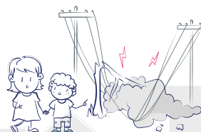
If you see a dangerous situation, tell an adult

For full terms and conditions visit www.endeavourenergy.com.au/electric-kids