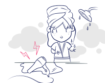
Water and electricity don't mix