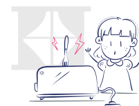
Never put a metal object in a toaster or powerpoint