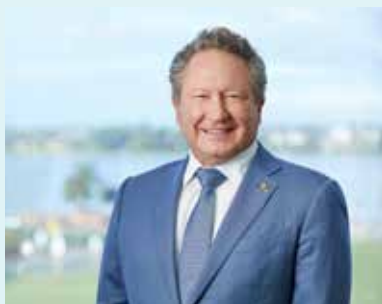
Dr Andrew Forrest AO Chairman

Fortescue has a talented and diverse Board committed to enhancing and protecting the interests of shareholders and other stakeholders and fulfilling a strong governance role