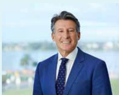
Lord Sebastian Coe CH, KBE Non-Executive Director