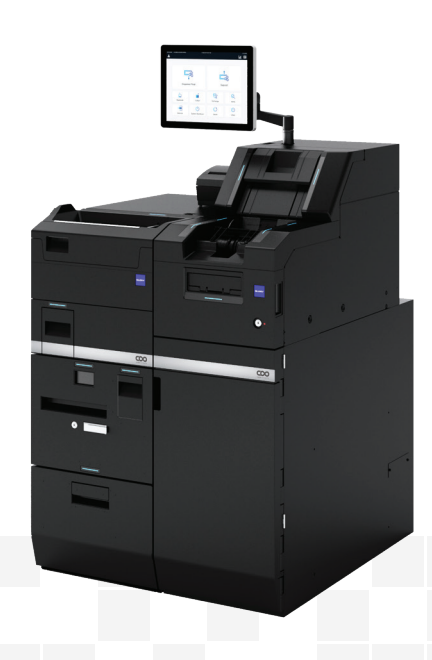
Large volume of cash