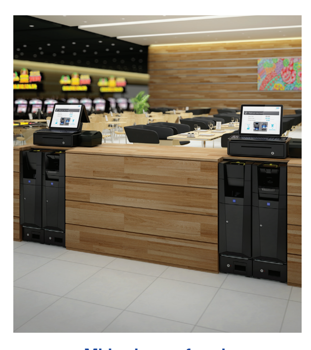
Mid volume of cash