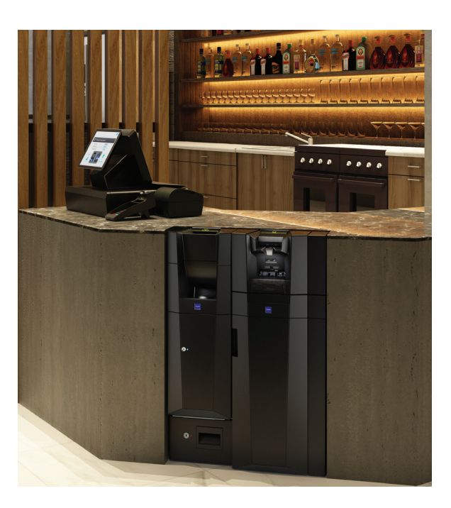
Large volume of cash