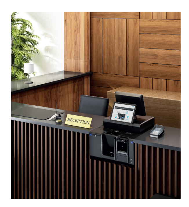
Small volume of cash

The CASHINFINITY Front-Office range of solutions fit every surface area, cash volume and hotel manager needs.