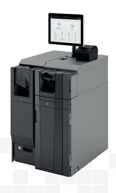
Small volume of cash

The CASHINFINITY Back-Office range can fit the needs of the hotel manager, whether that be volumes of cash or available surface area: