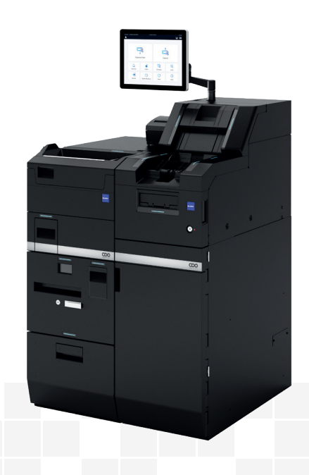
Mid volume of cash