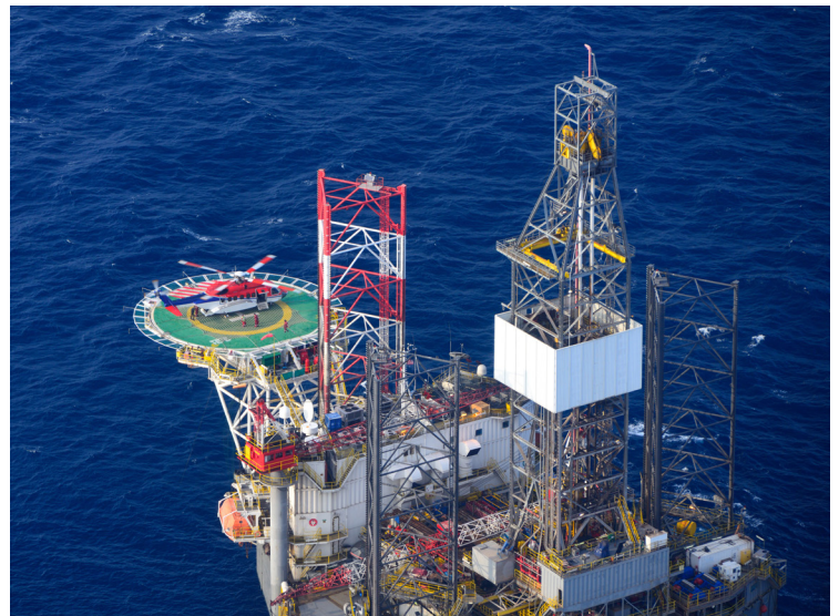
Offshore field developments, Europe's North Sea