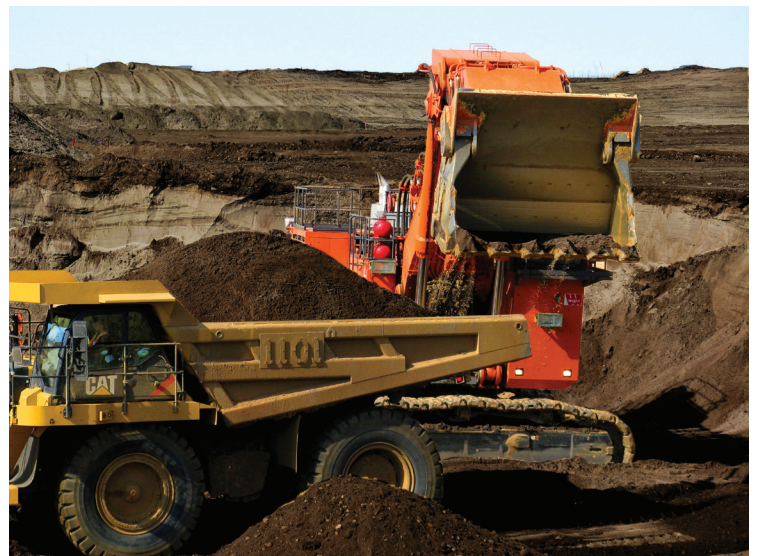
Fort Hills OPP project, Canada