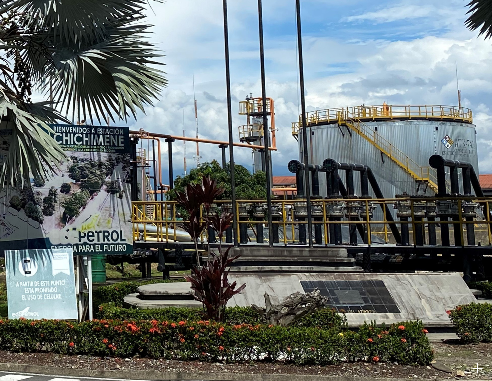
Chichimene Station Energy Transformation: Unlocking the potential of underground reservoirs for carbon sequestration and enhanced oil recovery