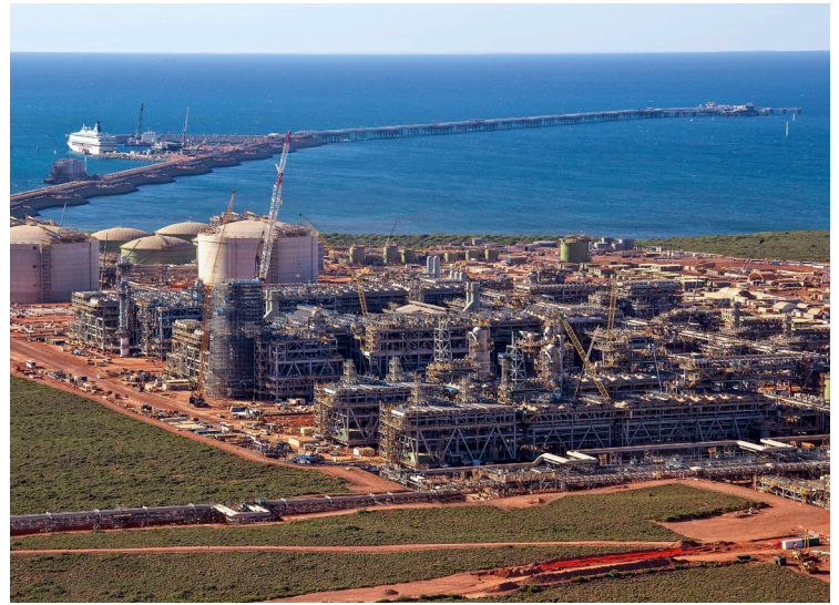
Gorgon LNG project, Barrow Island in Western Australia

This greenfield facility accepts 100,000 bpd of hot blended crude, and includes 300,000 bbl of tank storage, blending crude cooling, pumps, and interconnecting piping to ship blended crude to various tie-in locations within existing sites. We completed FEED, detailed engineering and construction support to develop this new plot area.