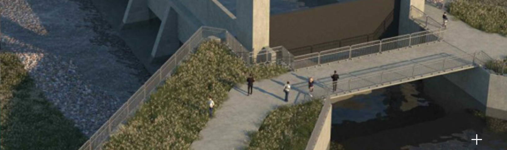
Fargo Moorhead Flood Risk Management