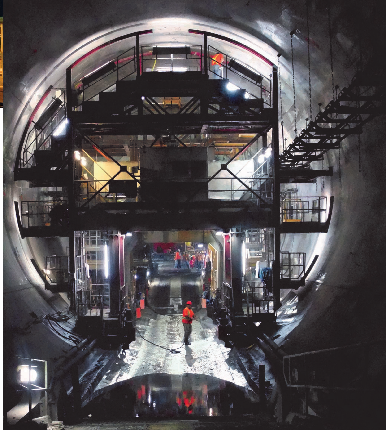
Niagara Tunnel Project

American Council of Engineering Companies Grand Award for Engineering Excellence Canadian Consulting Engineering Award of Excellence Consulting Engineers of Ontario Award of Merit International Water Power & Dam Construction North American Project of the Year Platts Global Energy Awards Premier Project Award Tunnelling Association of Canada Canadian Tunnelling Project of the Year