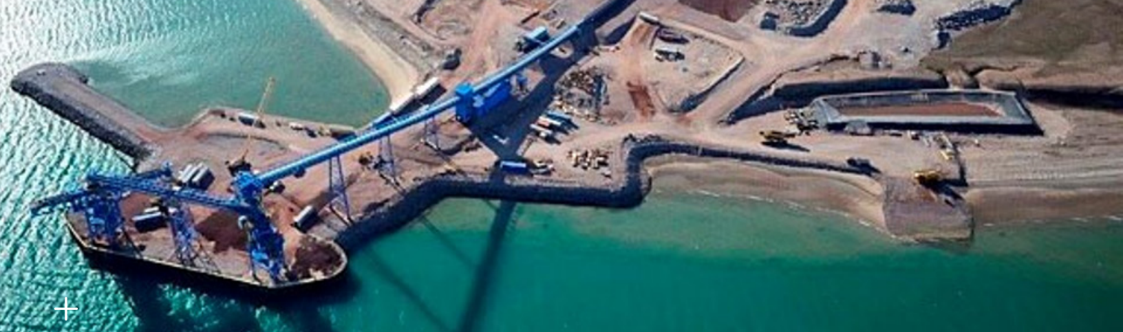
Mary River Baffinland Iron Mines Corporation