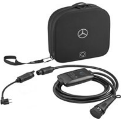
Flexible charging system Pro

The flexible Pro charging system is a mobile charging solution that enables charging at up to 22 kW*. The adapter connection point also makes it possible to adapt to every charging situation as needed. Whether at home, on the road or abroad, the flexible Pro charging system ensures safe and flexible charging for your BEV and PHEV vehicle.