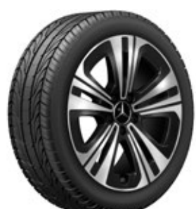
5-twin-spoke wheel, Aero

FA/RA: A174 401 0200 7X23 RA: A174 401 2300 7X23