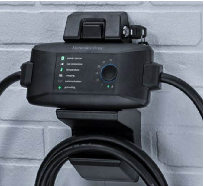
Flexible charging system wall mount

The flexible Pro charging system's wall mounting means it can be turned into a stationary wallbox. The integrated safety lock protects the system against theft.