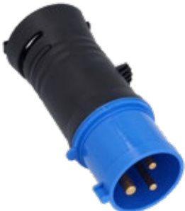
Adapter, CEE 32/1-phase

Using the CEE 32/1-phase adapter for the flexible Pro charging system, you can charge at up to 7.4 kW (230 V). The adapter is detected automatically by the flexible Pro charging system, meaning that no further settings are required.