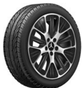
Y-Spoke Wheel, Aero

FA/RA: A174 401 2800 7X43 RA: A174 401 4700 7X43