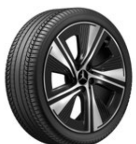
5-hole wheel, Aero

FA/RA: A174 401 3000 7X23 RA: A174 401 3100 7X23