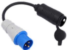
Adapter CEE 16/3-phase

With the CEE 16/3-phase adapter for the flexible Pro charging system, you can charge at up to 11 kW (400 V). The adapter is detected automatically by the flexible Pro charging system, meaning that no further settings are required.