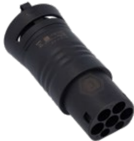
Adapter Type 2

The type 2 adapter for the flexible Pro charging system enables you to charge at up to 22 kW* (400 V) at public charging stations or wallboxes. The adapter is detected automatically by the flexible Pro charging system, meaning that no further settings are required.