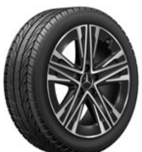
W-spoke wheel, Aero

FA/RA: A174 401 3400 7X23 RA: A174 401 3500 7X23