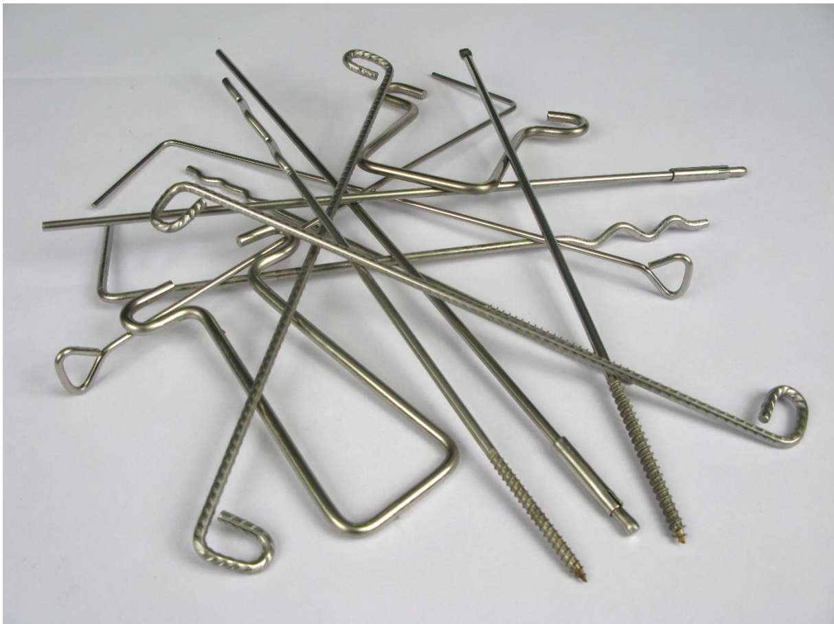
Figure 1 Steel ties

There are several different kinds and shapes of steel ties produced at Arminox. Below is a picture of steel ties with different shapes.