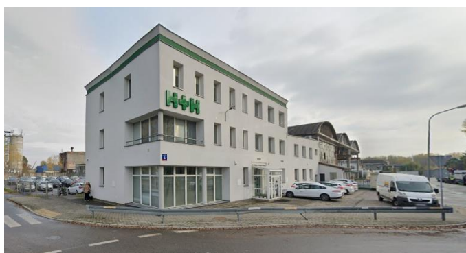
Fig. 1. The view from the street of H+H Polska Sp. z o. o. in Warsaw

H+H Polska Sp. z o. o. belongs to the H+H International A/S Group, a leading manufacturer of "white wall materials" in Europe, listed on the Copenhagen Stock Exchange. It has been operating on the Polish market since 2006. It produces and supplies a complete range of products made of autoclaved aerated concrete, and since 2018 also calcium silicate elements. The success of H+H Polska is the result of the joint work of nearly 600 people employed in 11 production plants. It is