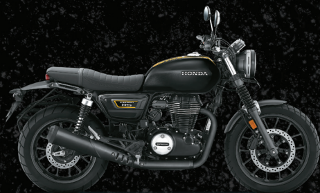
Pearl Igneous Black + Yellow