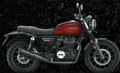
Rebel Red Metallic