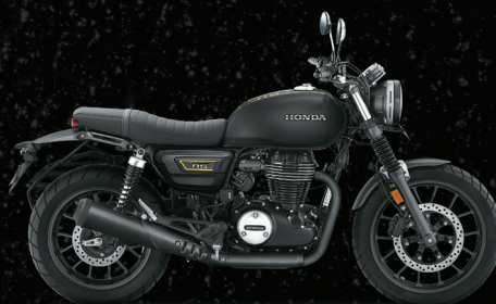
Mat Axis Grey Metallic