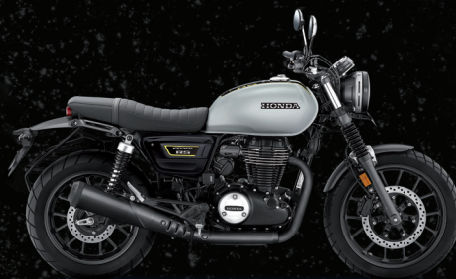
Pearl Deep Ground Grey