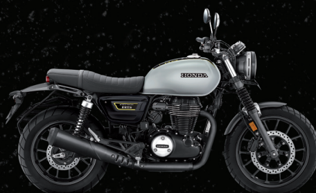
Pearl Deep Ground Grey

*Product shown in the picture may vary from actual product available in the market.