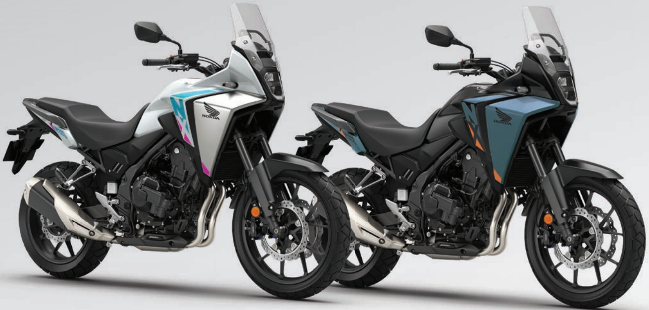
Pearl Horizon White