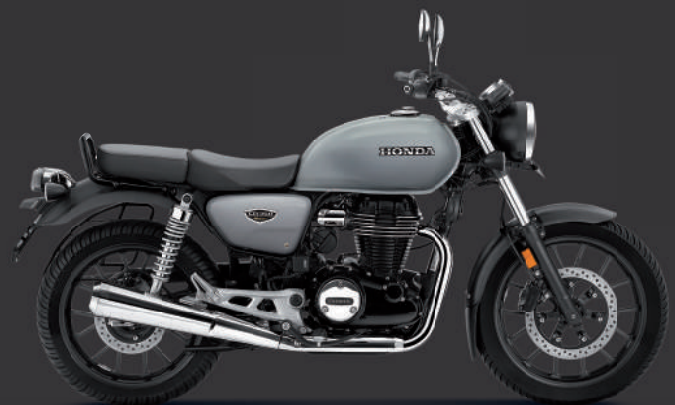
Pearl Deep Ground Grey

*Product shown in the picture may vary from actual product available in the market.