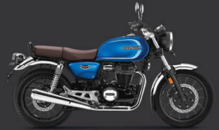
Athletic Blue Metallic