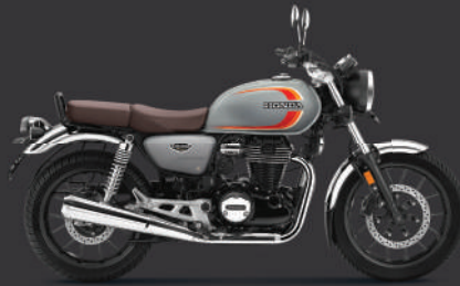
Pearl Deep Ground Grey