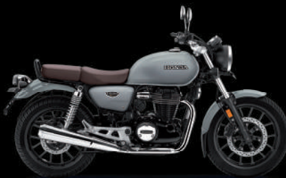
Pearl Deep Ground Grey