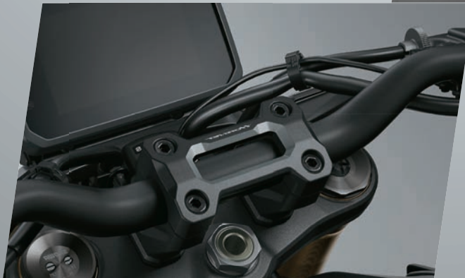
HANDLE HOLDER UP