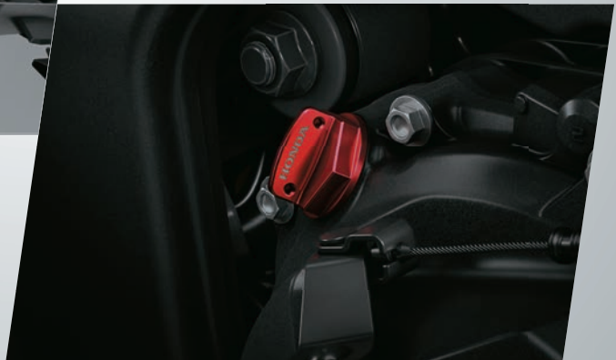
OIL FILLER CAP