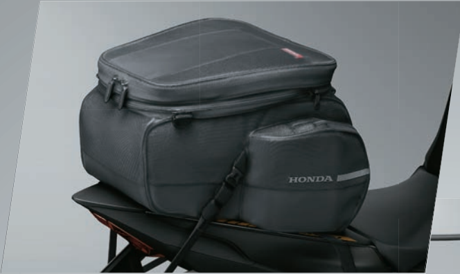
REAR SEAT BAG