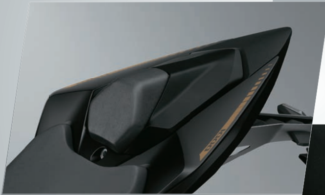
SEAT COWL BLACK