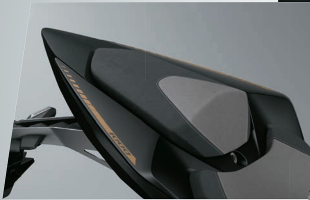
PILLION SEAT (ALCANTARA)