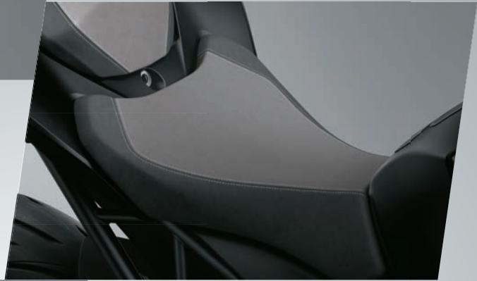
MAIN SEAT (ALCANTARA)