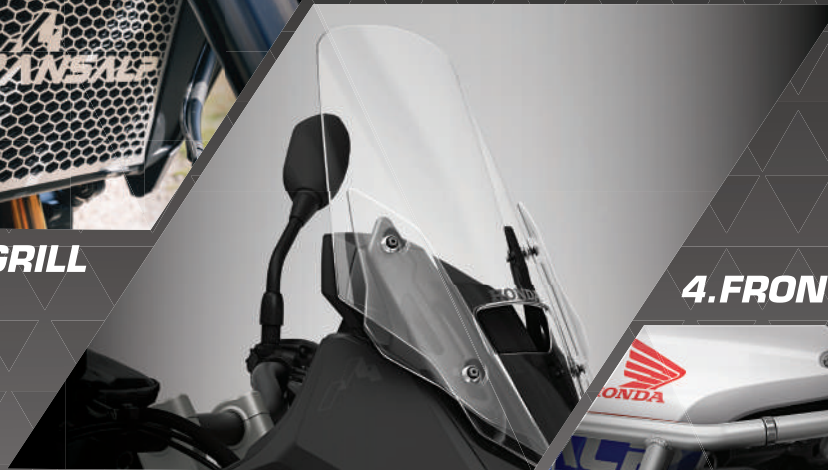
3. HIGH SCREEN