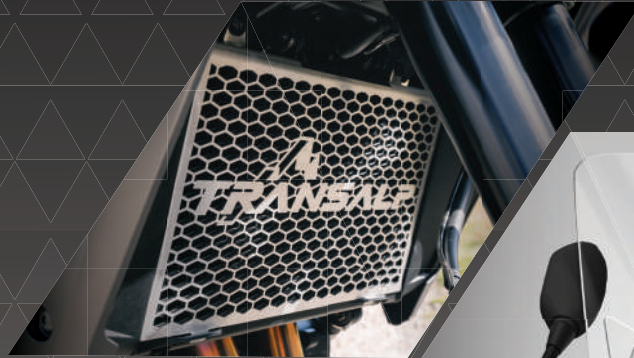
2. RADIATOR GRILL