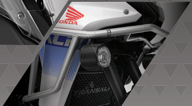
4. FRONT SIDE PIPE