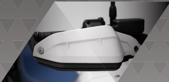
1. KNUCKLE GUARD