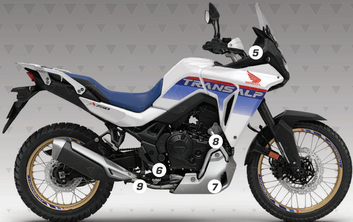
7. SKID PLATE