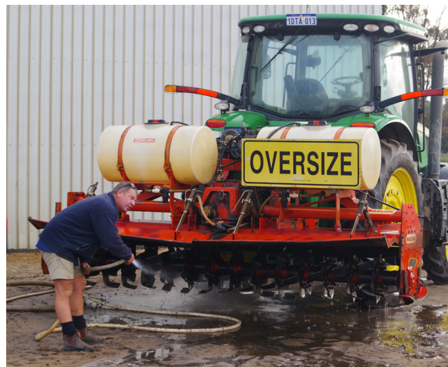
Figure 6 Establishing a fixed equipment wash-down bay can help restrict the spread of potato weed on the farm, particularly where it is not present at all or only present on part of the farm.

Farm hygiene may be less relevant for managing potato weed where it has already spread across the whole farm. Other difficulties associated with this approach include the time required to wash equipment down thoroughly, and the potential for uncontrolled spread in flood prone areas.