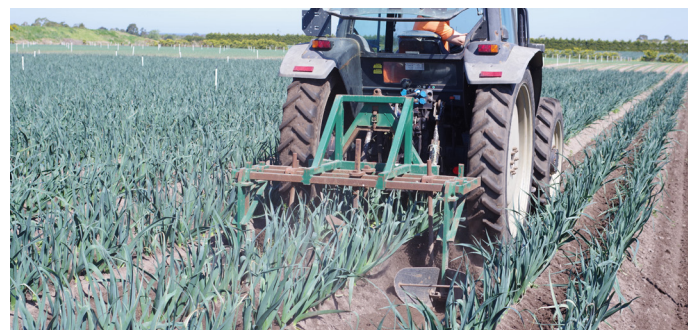
Figure 3 A shallow 'tickle' till within the crop row and between the plants early in their life cycle may help to manage recently germinated potato weed and other important broadleaf weeds.

Within growing crops, shallow inter-row tillage may be used to control many recently germinate potato weed and other weeds.