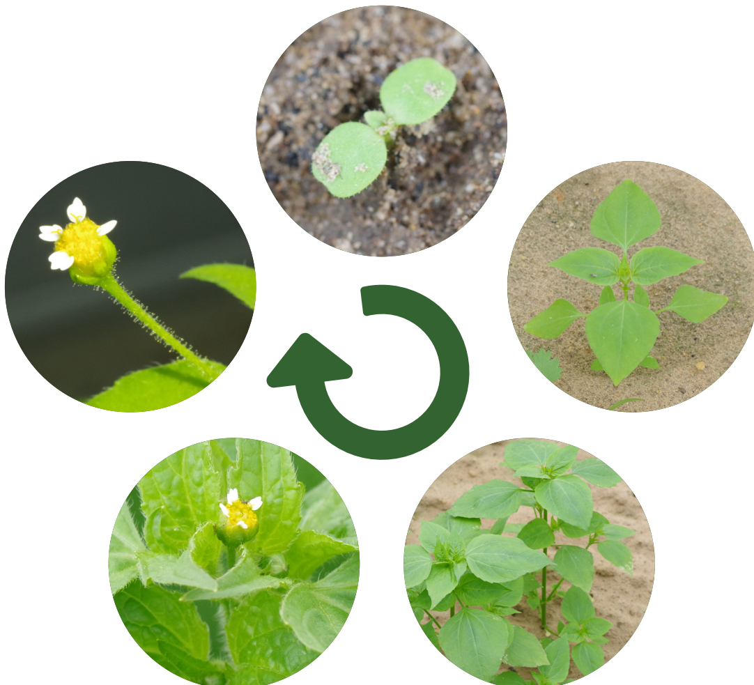
Figure 1 Life stages, from emergence to flowering

Figure 1 includes a series of photos of potato weed at different life stages in order to facilitate correct identification on-farm, from a young seedling through to a mature flowering plant.