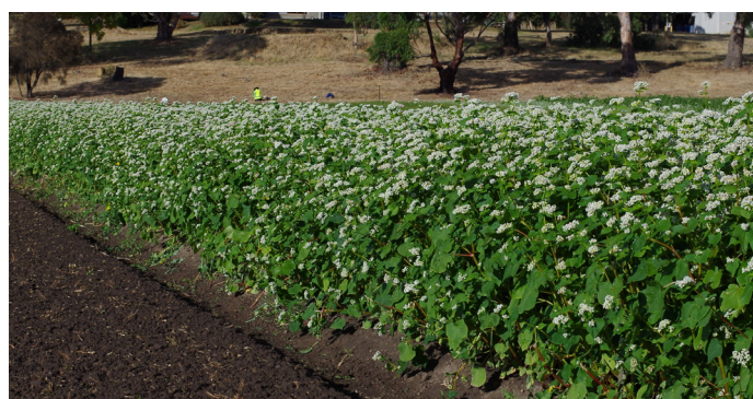
Figure 4 Rapid-establishing cover crop varieties such as buckwheat ( Fagopyrum esculentum ) appear to be effective in suppressing broadleaf weeds such as potato weed.

Where infestations have been particularly heavy, farmers in the US have taken their land out of production for three years, and established a dense sod or forage crop. After this period of time, they experienced little problem with potato weed.