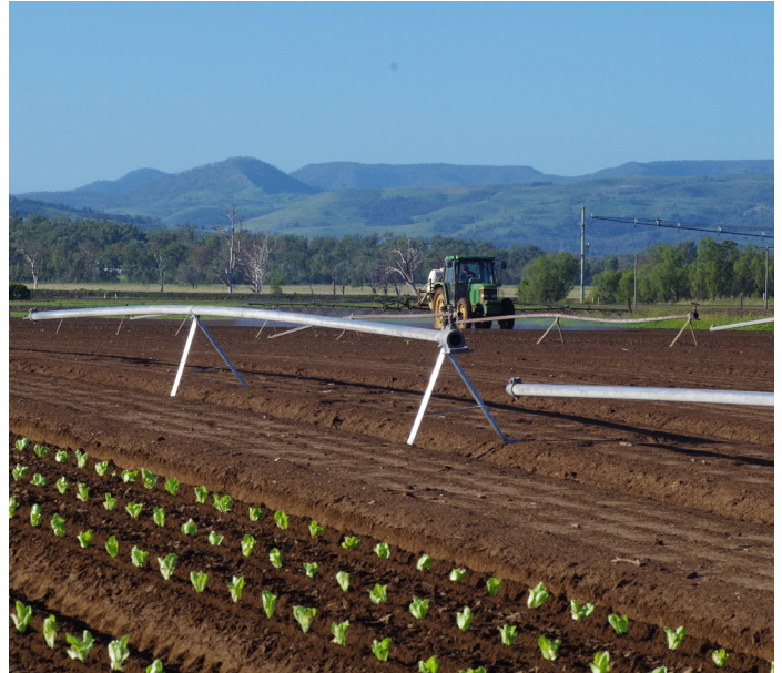
Figure 8 Pre-plant or pre-emergent herbicides are often one of the key techniques for management of potato weed in broadleaf vegetable crops, such as this lettuce crop near Gatton, Qld.

Herbicide resistant populations of potato weed have not yet been reported in Australia. The only reported instance of herbicide resistance in potato weed populations overseas at the time of writing involved the herbicide metamitron, and this herbicide was only registered in Australia for fruit thinning in apple orchards.