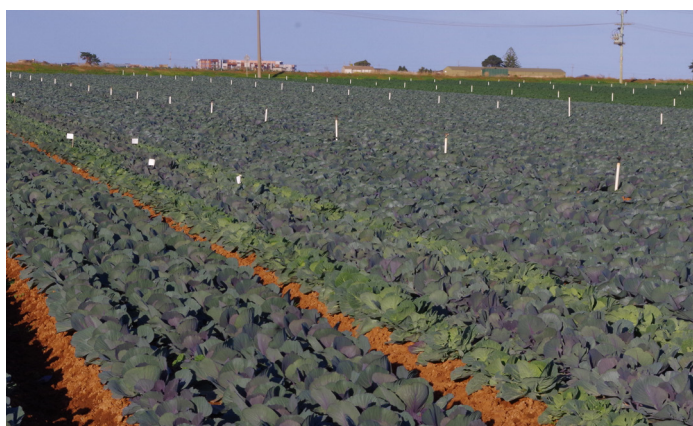
Figure 5 Ensuring appropriate planting density to allow good coverage of the crop beds can be useful along with other techniques (such as stale seed beds, inter-row tillage and pre-plant/pre-emergent herbicide application where available) to suppress potato weed and other weeds effectively within the crop beds.

Higher planting density may have some adverse effects, such as increased competition among crop plants (lowering yield) and greater risk of soil and plant diseases.