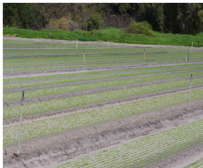
Figure 7 Diligent hand weeding over several seasons, utilised in combination with other weed management tactics, can result in almost complete eradication of weeds from the crop. In this paddock in Western Australia, farm staff were encouraged to remove all weeds by hand before seed set. They had succeeded in transforming a previously weedy paddock into one almost entirely free of weeds.

Combining hand weeding with pre-plant bed preparation (tillage, stale seed beds and pre-plant/pre-emergence herbicide), and inter-row tillage where it is feasible, will be very useful in managing surviving plants. The longevity of potato weed seed (up to 20 years) suggests that several seasons of diligent application will be required to obtain desired results.