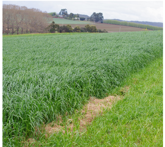
Figure 4 High biomass winter cover crops such as Italian ryegrass ( Lolium multiflorum ) growing here on a research farm near Devonport, Tasmania, appear to be effective at suppressing growth and seed set of chickweed due to their high biomass and dense canopy. Good management of the cover crop is required to maximise its performance and biomass production.

Selection of cover crop variety will need to take several factors into account, such as cost of and ability to grow the cover crop, its expected soil health benefits, relevance for breaking the disease cycle within the cash crop, and overall contribution to cash crop productivity. As the Tasmanian example shows, good establishment and a thick canopy is critical for achieving effective chickweed management using the cover crop.