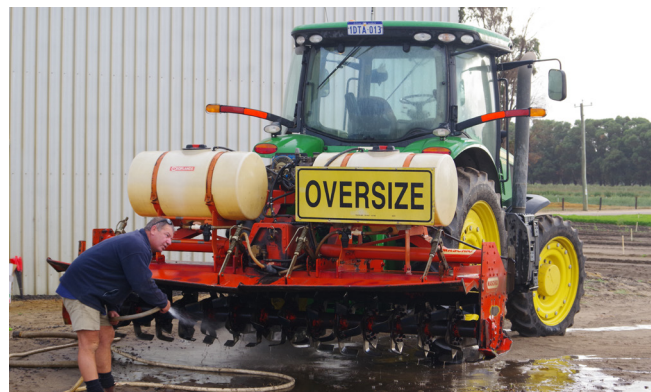
Figure 6 Establishing a fixed equipment wash-down bay can help restrict the spread of chickweed on the farm, particularly where it is not present at all or only present on part of the farm.

Farm hygiene may be less relevant for managing chickweed where it has already spread across the whole farm. Other difficulties associated with this approach include the time required to wash equipment down thoroughly, and the potential for uncontrolled spread in flood prone areas.