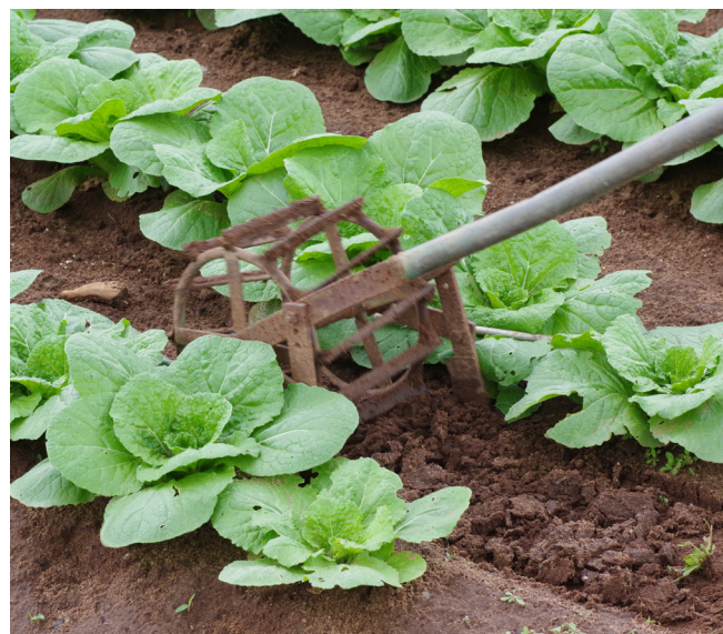
Figure 7 Removing recently germinated chickweed plants before they have a chance to establish is an effective follow-up to pre-plant tillage and herbicide control, and will have longer-term benefits in reducing the weed seed bank. Tools that require relatively little effort and allow coverage of a large area of ground in a relatively short time, such as the wheeled scarifier pictured here, can make this task easier depending on soil type and moisture level, and weed plant size. Using this and similar tools for larger chickweed plants is unlikely to be effective.

Farmers are generally hesitant to implement wide-scale hand weeding due to its high cost. However, selective and timely hand weeding can be a very effective follow-up to tillage and herbicide control in particular, especially when implemented earlier in the crop life cycle. Removing a few remaining chickweed plants by hand and taking any flowering or seeding plants away from the paddock may have significant benefits in reducing the weed seed bank in future crop seasons. It may also help prevent herbicide resistance from developing.