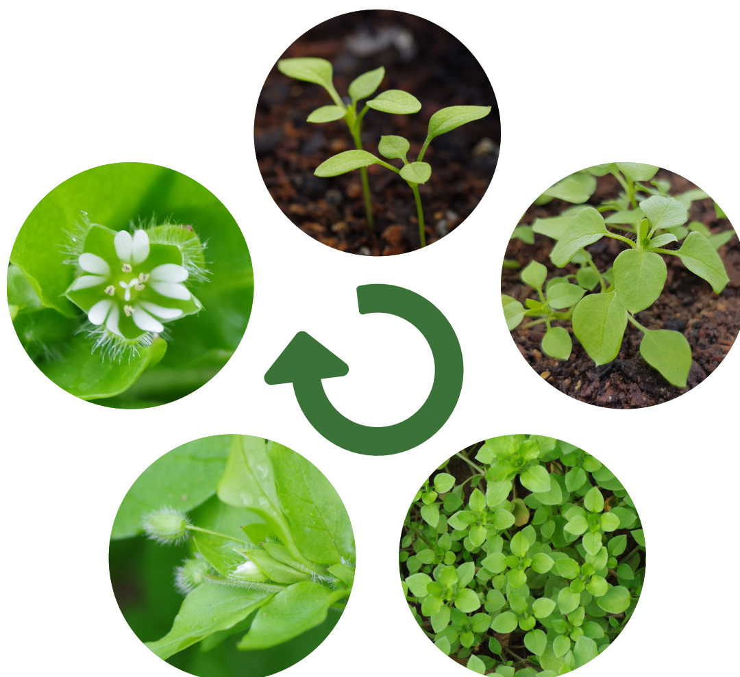
Figure 1 Life stages, from emergence to flowering

Figure 1 includes a series of photos of chickweed at different life stages in order to facilitate correct identification on-farm, from a young seedling through to mature plants and flowering.