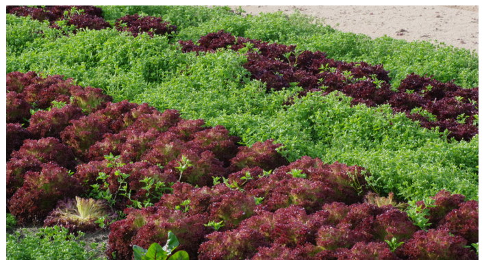
Figure 5 On a small area of this farm near Gingin, Western Australia, chickweed had become a significant problem within the lettuce crop and was dominant in the wheel tracks. While less feasible within this particular crop, this example illustrates that establishing a thick crop canopy (including shading the wheel tracks where possible) can be combined with other techniques such as tillage, pre-plant/pre-emergent herbicide application and selective hand weeding, to suppress chickweed and other weeds effectively within the crop beds.

Higher planting density may have some adverse effects, such as increased competition among crop plants (lowering yield) and greater risk of soil and plant diseases.