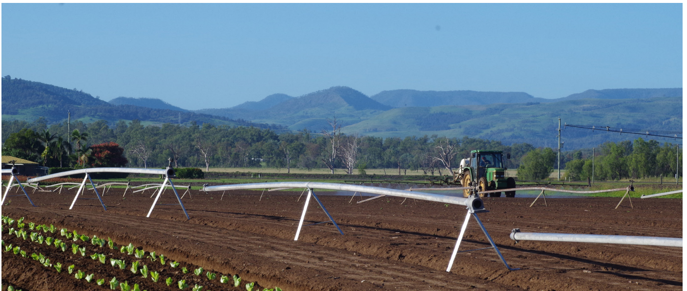
Figure 8 Pre-plant or pre-emergent herbicides are often one of the key techniques for management of chickweed in broadleaf vegetable crops, such as this lettuce crop near Gatton, Qld.

There is growing evidence of chickweed resistance to ALS-inhibitor herbicides in North America and Europe, particularly in wheat production. This includes chlorsulfuron, metsulfuron, tribenuron, triasluflron, sulfometuron, flumetsulam, and imazapyr, though at the time of writing none of these were used in Australian vegetable production. Some resistant chickweed populations have also been found overseas to the herbicides MCPA and 2-4-D amine.