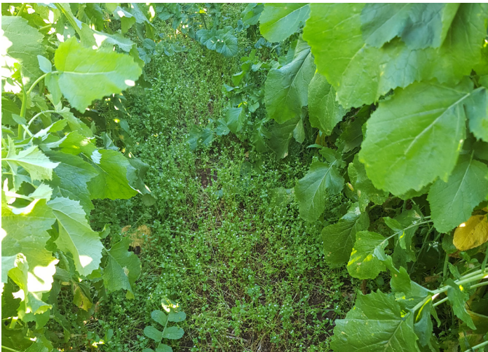
Figure 2 Regular soil disturbance and addition of organic materials, and heavy seeding of the weed, means that chickweed can quickly become dominant within vegetable crops. Within higher stature crops, such as this 'Caliente' mustard ( Brassica juncea ) cover crop, its direct competitive impact on the crop will be less significant. However, its capacity for growth and seeding beneath a relatively open canopy has implications for following lower stature crops.