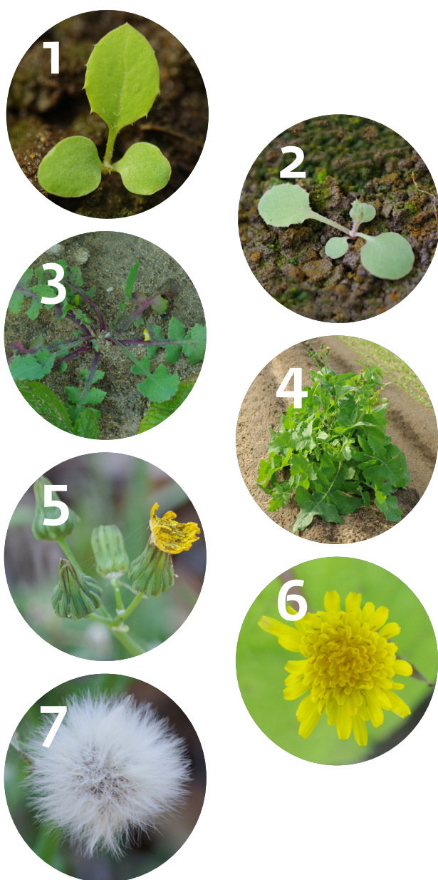
Figure 1 Life stages, from emergence to seed production

Figure 1 includes a series of photos of common sowthistle at different life stages, from a young seedling through to a mature flowering plant, including images of the flowers and seed.