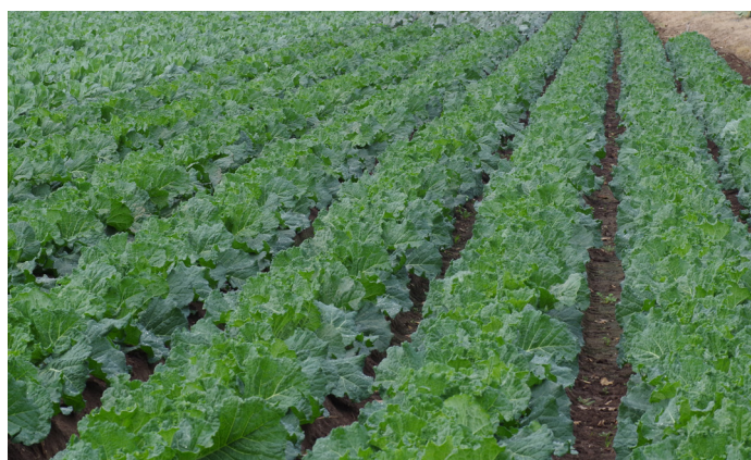
Figure 6 On this farm near Richmond, New South Wales, appropriate planting density was combined with planting along an east-west axis in an effort to achieve greater shading of the wheel tracks. This can be used along with other techniques (such as tillage, pre-plant/pre-emergent herbicide application and selective hand weeding) to suppress common sowthistle and other weeds effectively within the crop beds.