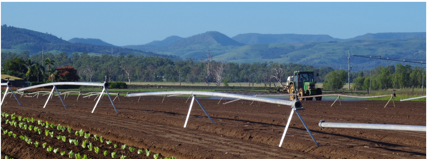
Figure 8 Pre-plant or pre-emergent herbicides are often one of the key techniques for management of common sowthistle in broadleaf vegetable crops, such as this lettuce crop near Gatton, Qld.

Using other herbicide products for common sowthistle control during a fallow period has been recommended to control herbicide-resistant plants before seed set, integrated with other non-herbicide approaches (such as tillage) to prevent build-up of herbicide-resistant weed seed banks.