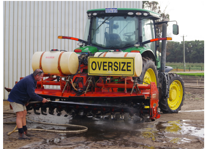
Figure 7 Establishing a fixed equipment wash-down bay can help restrict the spread of common sowthistle on the farm, particularly where it is not present at all or only present on part of the farm.

Farm hygiene may be less relevant for managing common sowthistle where it has already spread across the whole farm. Other difficulties associated with this approach include the time required to wash equipment down thoroughly, and the potential for uncontrolled spread from neighbouring properties due to wind or flooding.