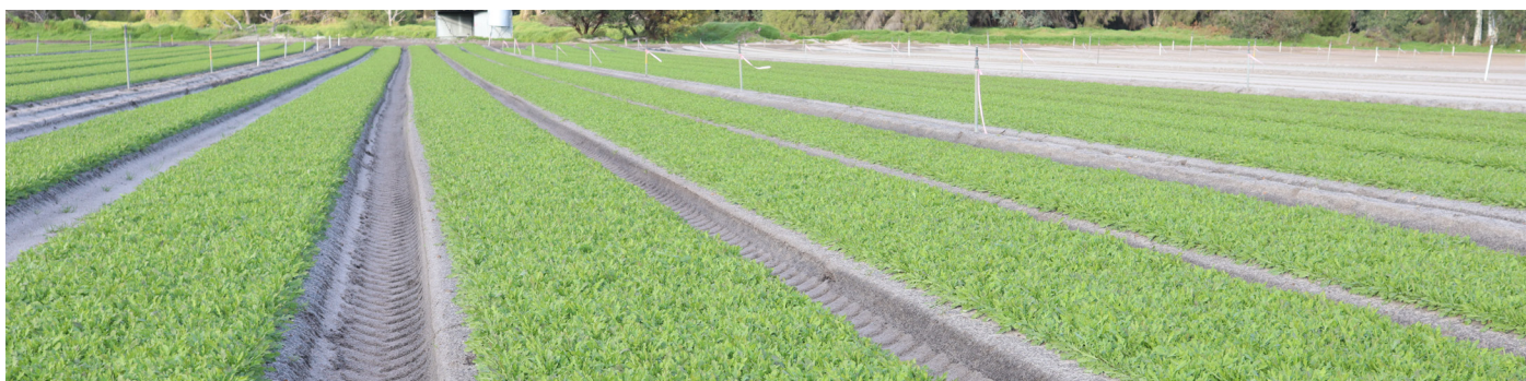
Figure 9 Dedicated application of a well planned integrated weed management strategy can result in little weed impact by the time of harvest, such as in this loose leaf crop in Western Australia.

In applying this '3D' approach, a variety of options is available as described on the next page. This is commonly known as 'integrated weed management', and is likely to bring you the greatest chance of long-term success in restricting the impact of common sowthistle on your farm.