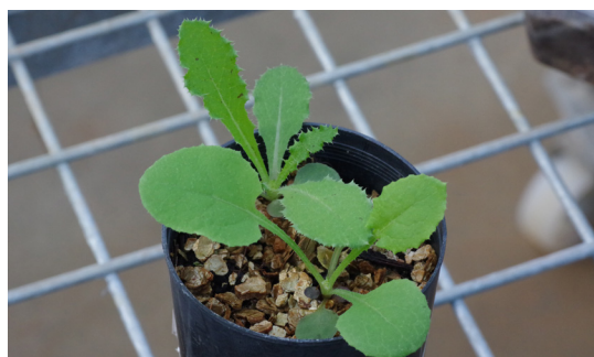
Figure 2 Prickly sowthistle (top-left plant) and common sowthistle (bottom-right plant) showing the differing leaf forms of the plants.

At its early growing stages, common sowthistle is almost indistinguishable from prickly sowthistle ( Sonchus asper ), a weed that is also common in Australian vegetable farms and has much the same impacts as common sowthistle. However, as a larger plant, prickly sowthistle is distinguishable from common sowthistle by its leaf form, which is thicker, more curled and with much more significant spines along the leaf margins (Figures 2 and 3). Management of the two species will largely be the same.