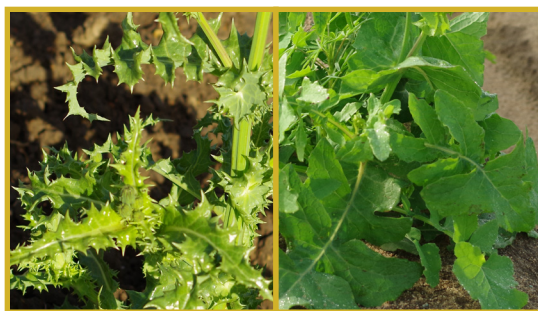
Figure 3 Prickly sowthistle (left) and common sowthistle (right) mature plants, showing the significantly different leaf forms.