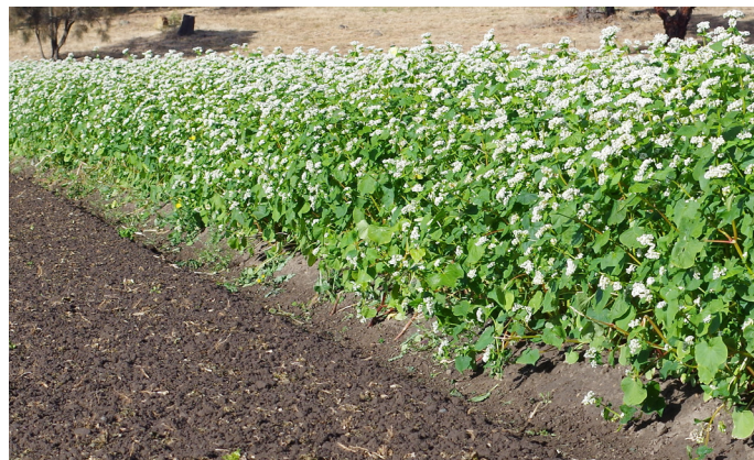
Figure 5 Rapidly establishing and high biomass cover crops appear to be particularly effective in suppressing common sowthistle emergence and growth due to their early establishment, high biomass and dense canopy. Here, buckwheat ( Fagopyrum esculentum ) was effective for managing both common sowthistle and prickly sowthistle (as well as a range of other broadleaf weed species) in an on-farm trial near Hobart, Tasmania.

Since these two cover crop varieties also formed a dense canopy, this suggests that early cover crop establishment and canopy shading is particularly important for effective suppression of common sowthistle, given that seed germination rates are higher for this weed where light is available, and seedlings require light to grow to maturity.