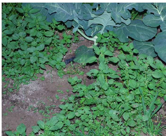
Figure 3 Regular soil disturbance and addition of organic materials, and heavy seeding of the weed, means that dwarf nettle can quickly become dominant within vegetable crops.

Dwarf nettle hosts a range of vegetable crop pests and diseases in Australia and elsewhere around the world. These include Pratylenchus nematodes, viruses (including cucumber mosaic virus), Verticillium wilt, and aphids.