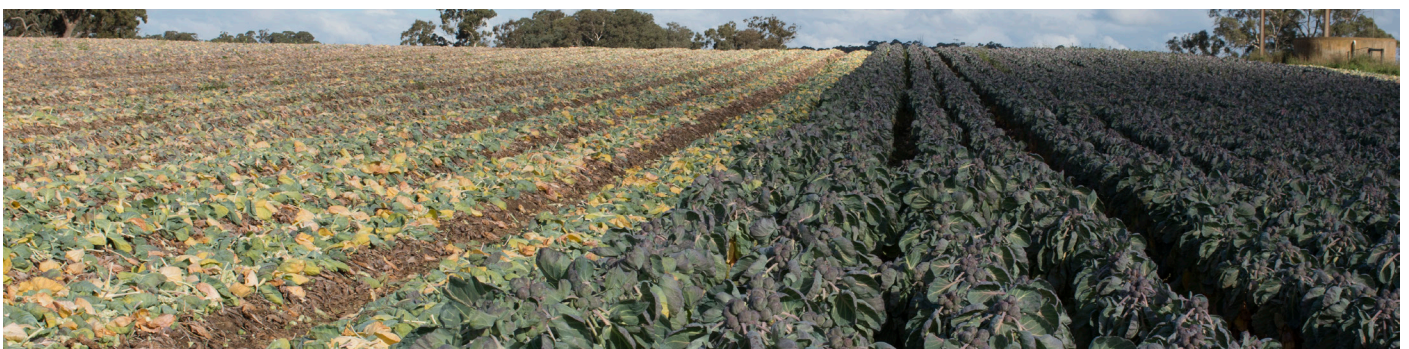
Figure 10 Dedicated application of a well planned integrated weed management strategy can result in little weed impact by the time of harvest, such as in this Brussels sprouts crop in South Australia.

In applying this '3D' approach, a variety of options is available as described on the next page. This is commonly known as 'integrated weed management', and is likely to bring you the greatest chance of success in restricting the impact of dwarf nettle on your farm.