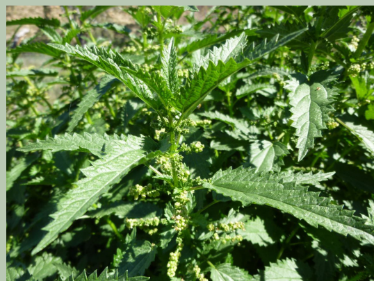
Figure 2 native scrub nettle flowers and leaves.

Compared to dwarf nettle, native scrub nettle reaches up to 1m in height, has longer lance-shaped leaves (up to 12 cm) that are paler beneath, fewer stinging hairs, and spike-like clusters of flowers that can be longer than the leaf stalks.