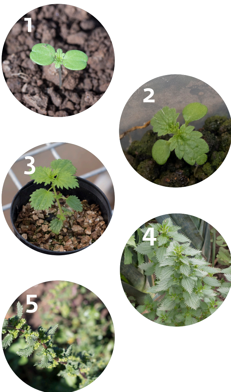
Figure 1 Life stages, from germination to flowering

Dwarf nettle ( Urtica urens ) is an annual herbaceous plant, native to Mediterranean Europe, that grows between 10 and 75 cm in height.