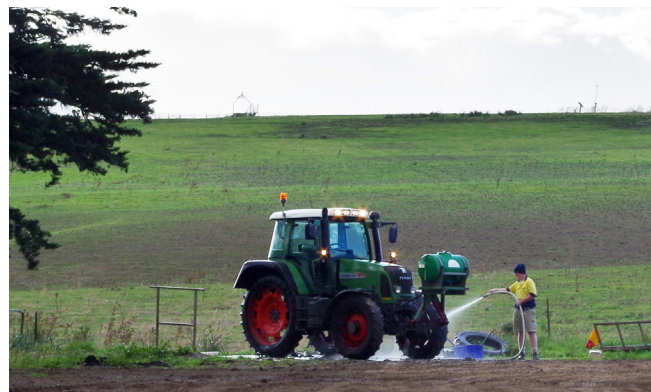
Figure 7 Establishing a fixed equipment wash-down bay can help restrict the spread of dwarf nettle on the farm, particularly where it is not present at all or only present on part of the farm.

Farm hygiene may be less relevant for managing dwarf nettle where it has already spread across the whole farm. Other difficulties associated with this approach include the time required to wash equipment down thoroughly, and the potential for uncontrolled spread in flood prone areas.