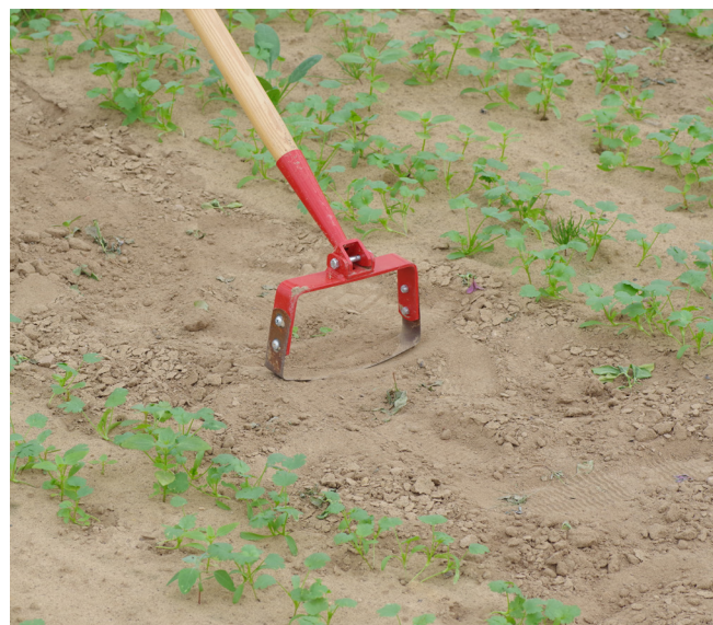
Figure 8 Removing recently germinated weeds such as dwarf nettle before they have a chance to establish is an effective follow-up to pre-plant tillage and herbicide control, and will have longer-term benefits in reducing the weed seed bank. Tools that require relatively little effort, such as the stirrup hoe pictured here, can make this task easier depending on soil type and moisture level, and weed plant size.

Farmers are generally hesitant to implement wide-scale hand weeding due to its high cost. However, selective and timely hand weeding can be a very effective follow-up to tillage and herbicide control in particular, especially when implemented earlier in the crop life cycle. Removing a few remaining dwarf nettle plants by hand and taking any flowering or seeding plants away from the paddock may have significant benefits in reducing the weed seed bank in future crop seasons. It may also help prevent herbicide resistance from developing.