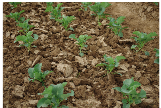
Figure 4 A shallow 'tickle' till within the crop row and between the plants early in their life cycle may help to manage recently germinated dwarf nettle and other important broadleaf weeds, allowing the crop to form a canopy before the weed problem becomes significant within the rows. Relevance of this technique will depend on crop/s grown, and availability of intra-row tillage equipment. In this crop in South Australia, a Weed Fix cultivator is used to manage weeds such as dwarf nettle within the crop beds.

The capacity of dwarf nettle seed to remain dormant in the soil for many years suggests that inversion ploughing or deeper ripping may create problems, either by bringing long-dormant dwarf nettle seeds to the surface, or burying large numbers of viable seed to become a future problem in the paddock.