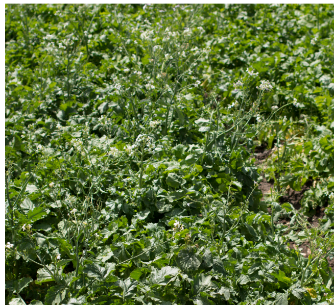
Figure 5 Rapidly establishing and high biomass brassica cover crops have been shown to be particularly effective in suppressing dwarf nettle germination and growth due to their high biomass and dense canopy. Here, tillage radish ( Raphanus sativus ) was effective for managing a variety of broadleaf weed species on a farm near Hobart, Tasmania.

Selection of cover crop variety will need to take several factors into account, such as cost of and ability to grow the cover crop, its expected soil health benefits, relevance for breaking the disease cycle within the cash crop, and overall contribution to cash crop productivity. As the United States example shows, good establishment is critical for achieving effective weed management using the cover crop.