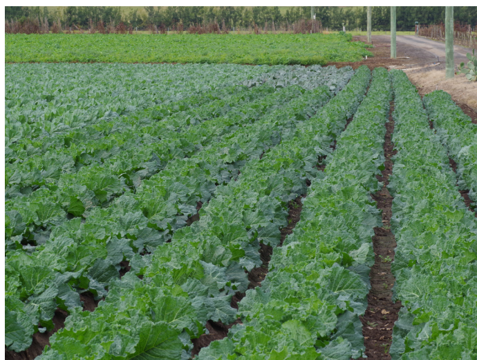
Figure 6 On this farm near Richmond, New South Wales, appropriate planting density was combined with planting along an east-west axis in an effort to achieve greater shading of the wheel tracks. This can be used along with other techniques (such as tillage, pre-plant/pre-emergent herbicide application and selective hand weeding) to suppress dwarf nettle and other weeds effectively within the crop beds.

Where it is appropriate to the crop, higher plant density and variety selection (including shading of wheel tracks where this is possible) may contribute to reduced dwarf nettle impact in the longer term.