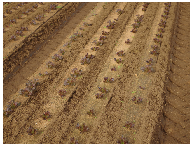
Figure 3 A shallow 'tickle' till within the crop row and between the plants early in their life cycle may help to manage recently germinated fat hen and other important broadleaf weeds, allowing the crop to form a canopy before the weed problem becomes significant within the rows. Relevance of this technique will depend on crop/s grown, and availability of intra-row tillage equipment.

Tillage type may also influence fat hen emergence. In one study, emergence of fat hen in chisel plough plots was far more significant than in comparative plots comprising no-till or mouldboard ploughing followed by cultipacking, in a corn production system.