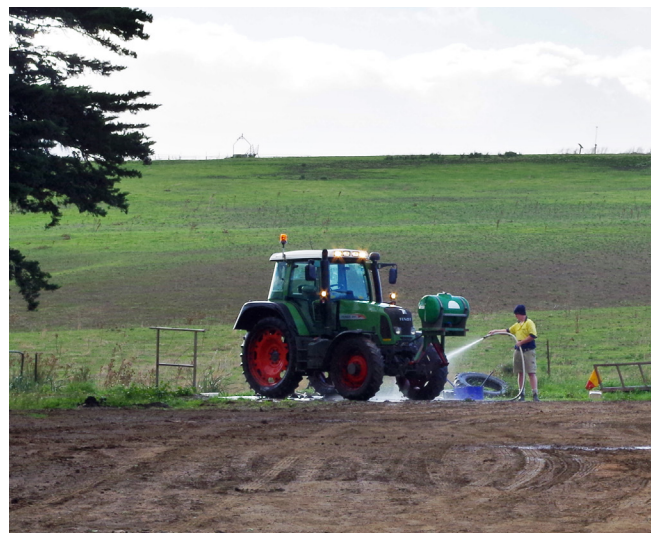
Figure 6 Establishing a fixed equipment wash-down bay can help restrict the spread of fat hen on the farm, particularly where it is not present at all or only present on part of the farm.

Farm hygiene may be less relevant for managing fat hen where it has already spread across the whole farm. Other difficulties associated with this approach include the time required to wash equipment down thoroughly, and the potential for uncontrolled spread in flood prone areas.