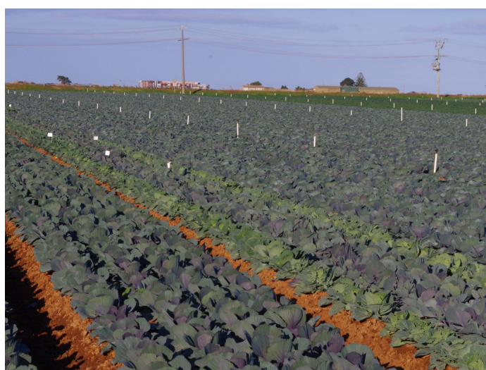
Figure 5 Ensuring appropriate planting density to allow good coverage of the crop beds can be useful along with other techniques (such as tillage and pre-plant/pre-emergent herbicide application) to suppress fat hen and other weeds effectively within the crop beds, as this example of a brassica crop near Werribee, Vic, illustrates.

Where it is appropriate to the crop, higher plant density and variety selection (including shading of wheel tracks where this is possible) may contribute to reduced fat hen impact in the longer term.