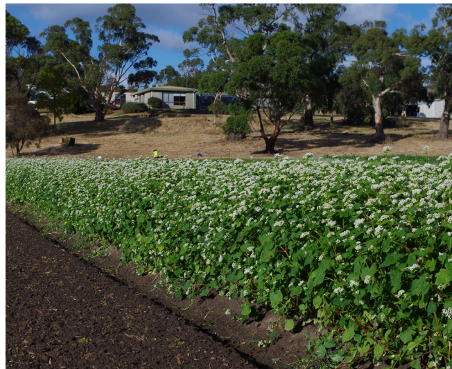
Figure 4 Newer cover crop varieties such as Buckwheat ( Fagopyrum esculentum ) appear to be effective in suppressing broadleaf weeds such as fat hen, as observed on this farm near Hobart, Tas.

Heavier crop residues may also reduce the impact of fat hen. In one overseas study, higher residues of corn crops left in the crop beds after harvesting reduced emergence of fat hen. More specifically, untilled plots saw a greater emergence of fat hen seedlings than tilled plots, but untilled plots with greater crop residue left behind were less prone to this weed species than comparable tilled plots.