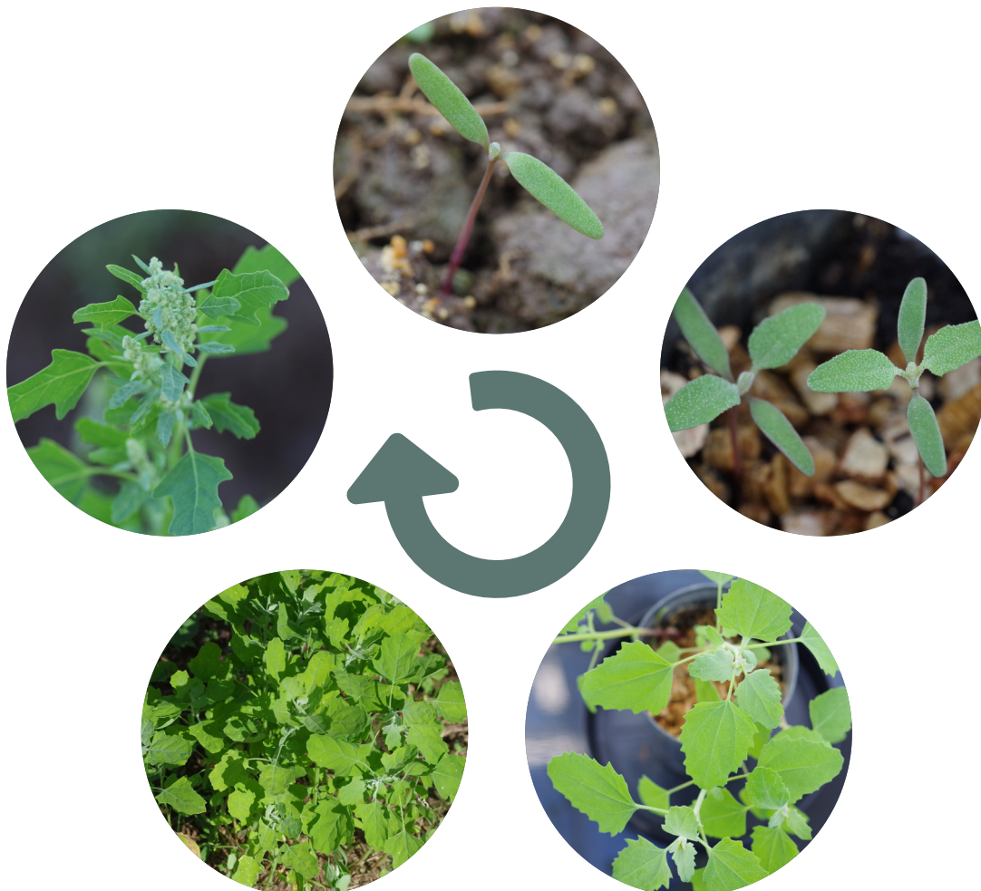
Figure 1 Life stages, from germination to flowering

Figure 1 includes a series of photos of fat hen at different life stages in order to facilitate correct identification on-farm, from a young seedling through to a mature flowering plant.