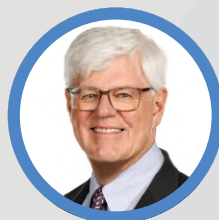
HON. JOHN P. MANLEY PC, O.C., F.ICD