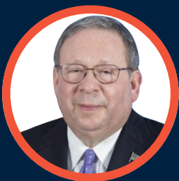
DAVID L. COHEN US Ambassador to Canada